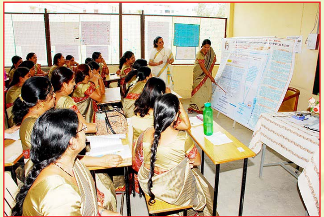
Presentation of Unified Field chart by teachers of MVM, Hyderabad