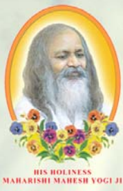
HIS HOLINESS MAHARISHI MAHESH YOGI JI