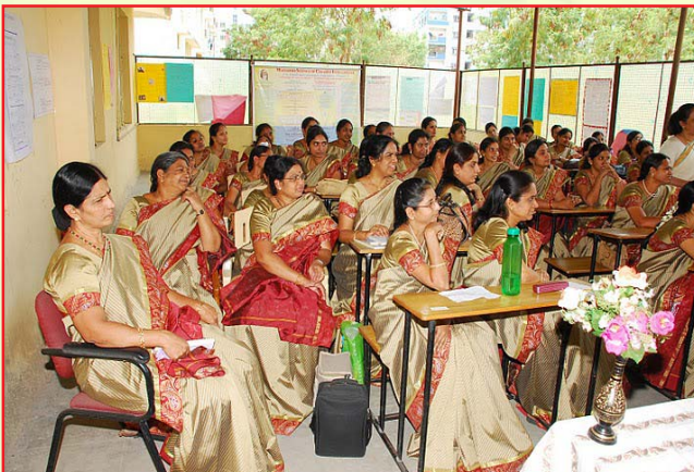
Presentation of Unified Field chart by teachers of MVM, Hyderabad during Consciousness-Based Education Training Programme