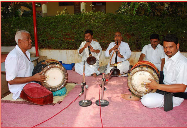
Mridangam and Nadaswaram Vadak performing on the occasion of Inauguration Day of New Academic Session 2011-2012