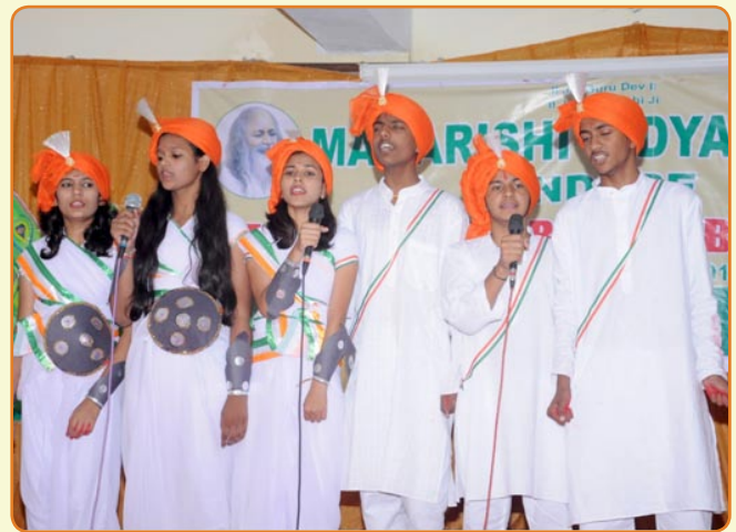
Senior group of MVM students presenting group patriotic song