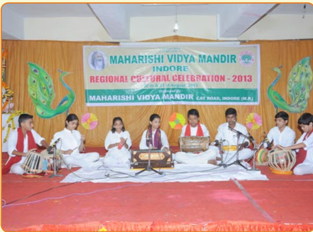
Students of Maharishi Vidya Mandir presenting Indian classical orchestra in mixed group