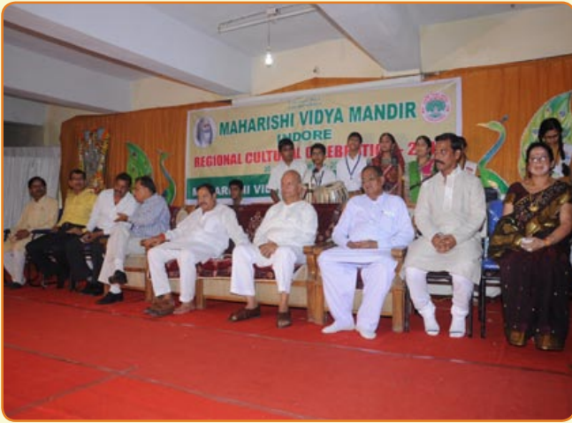
Chief Guest Shri Krishna Murari Moghe, Mayor, Indore, sitting with other dignitaries on the dais on the occasion of Maharishi Regional Cultural Celebration 2013