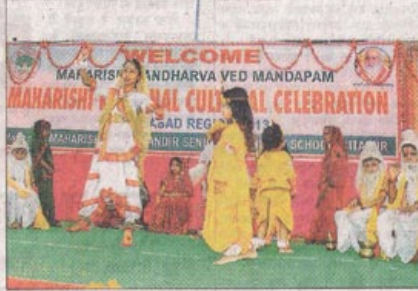
सांस्कृतिक कार्यक्रमों की प्रस्तुति करते महर्षि विद्या मंदिर के बच्चों