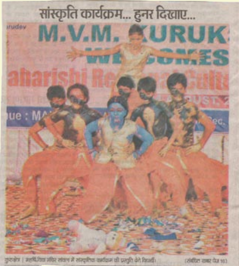
कुरुक्षेत्र | महर्षि विद्या मंदिर स्कूल में संस्कृतिक कार्यक्रम की प्रस्तुति देते विद्यार्थी।