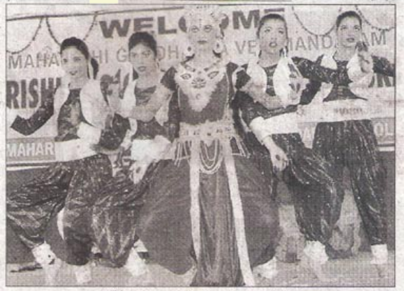
महर्षि विद्या मंदिर स्कूल में सांस्कृतिक कार्यक्रम प्रस्तुत करते बच्चों