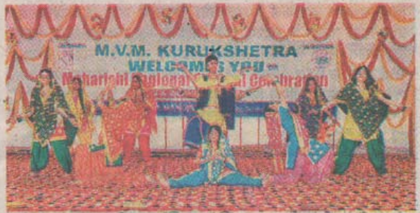
कुरुक्षेत्र. महर्षि विद्या सांख्य में आयोजित दो दिवसीय सांस्कृतिक कार्यक्रम की प्रस्तुति देते विद्यार्थी।

विभिन्न प्रांतों के छात्र प्रतियोगिताओं में दम दिखाएंगे