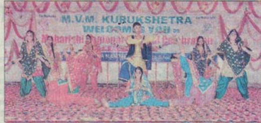
महर्षि विद्या मंदिर में आयोजित क्षेत्रीय सांस्कृतिक कार्यक्रम में प्रस्तुति देते विद्यार्थी।