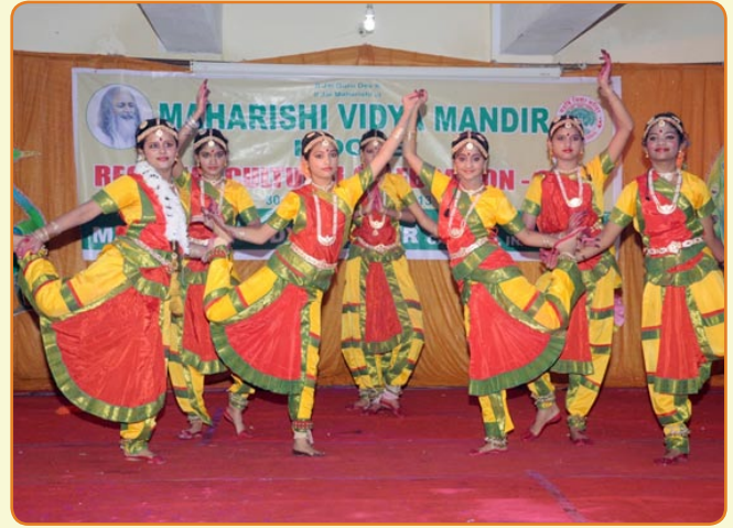
Students of Maharishi Vidya Mandir performing in group dance competition by junior girls