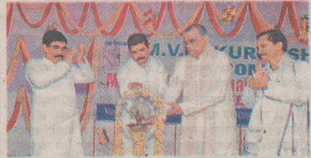
कुरुक्षेत्र. महर्षि विद्या सांख्य में आयोजित दो दिवसीय सांस्कृतिक कार्यक्रम का शुभारंभ करते मुख्यातिथि।