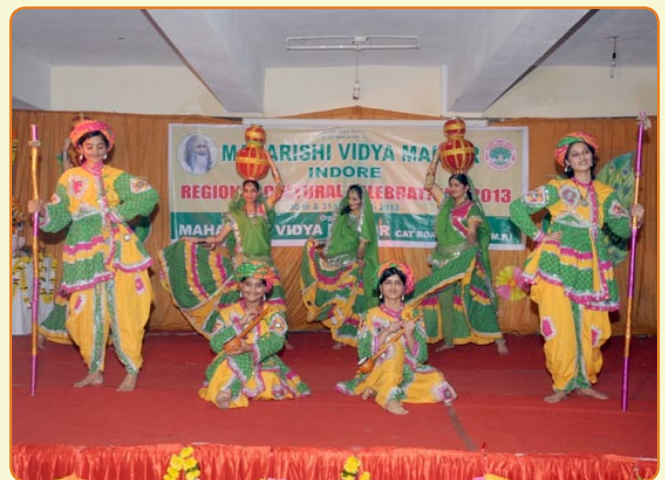
Students of Maharishi Vidya Mandir presenting group dance in junior girls category