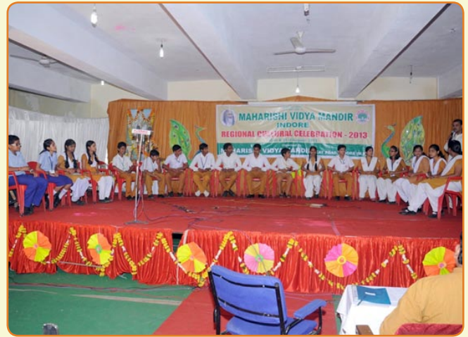
Students of Maharishi Vidya Mandir participating in English and Hindi debate competition