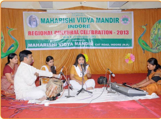
Students of Maharishi Vidya Mandir performing during Indian vocal classical singing competition by senior group