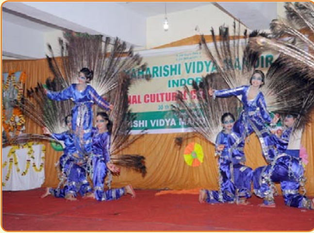
Students of Maharishi Vidya Mandir presenting mayur dance during dance competition by junior girls