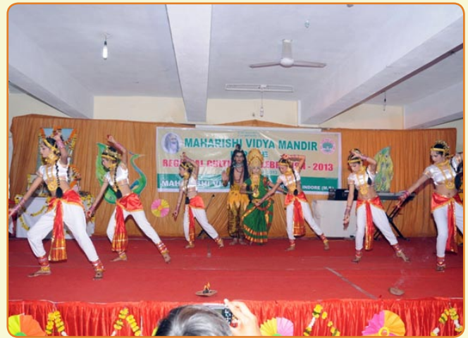
Students of Maharishi Vidya Mandir are performing during group dance competition by senior girls.