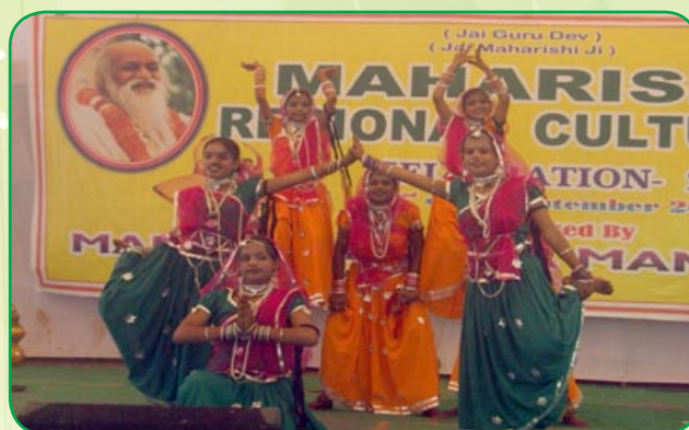
Group Dance Performed by MVM Students