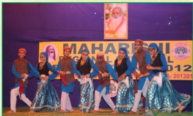
MVM students are performing folk dance on the occasion of Maharishi Regional Cultural Celebration 2012