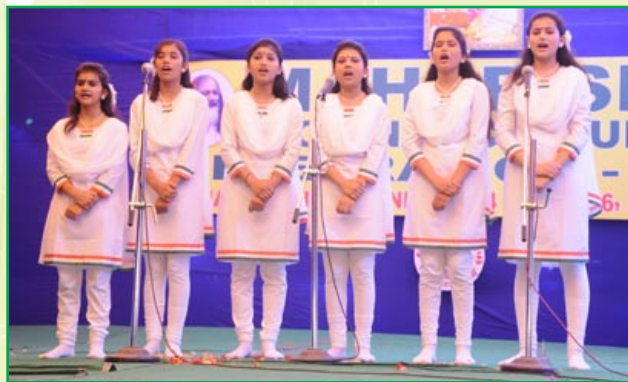
MVM students are presenting group song on the occasion of Maharishi Regional Cultural Celebration 2012