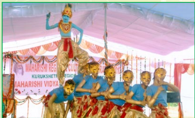
Students of MVM Yamuna Nagar performing 'Shri Krishna Leela'