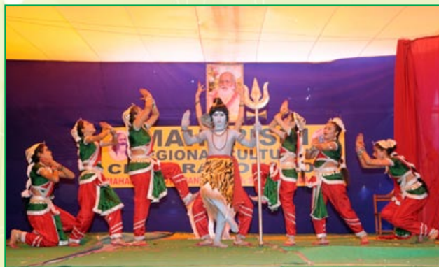
MVM students are presenting 'Shiv Stuti' on the occasion of Maharishi Regional Cultural Celebration 2012