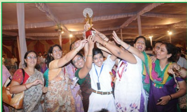
Winners of Maharishi Regional Cultural Celebration 2012 with winning trophy