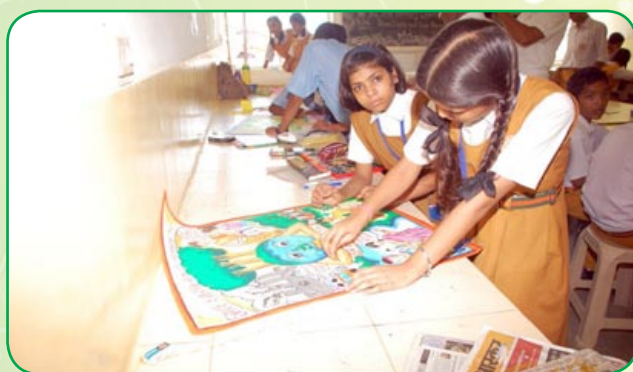
On the spot painting competition

The first day has ended with quiz competition which was full of knowledge and it had entertained all.