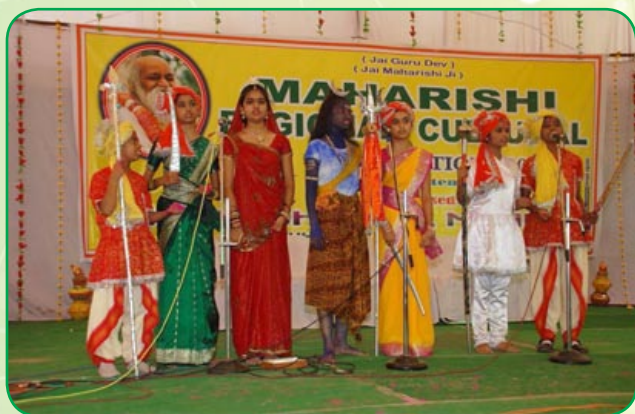
Group Song Performed by MVM Students