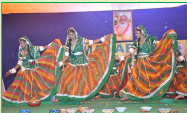
MVM students are presenting folk dance on the occasion of Maharishi Regional Cultural Celebration 2012