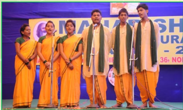
MVM students are presenting group song on the occasion of Maharishi Regional Cultural Celebration 2012