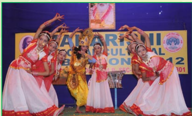
MVM students are performing 'Shri Krishna Leela' on the occasion of Maharishi Regional Cultural Celebration 2012