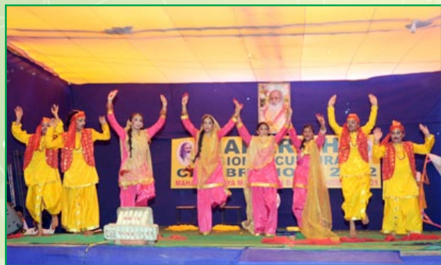
MVM students are performing folk dance on the occasion of Maharishi Regional Cultural Celebration 2012