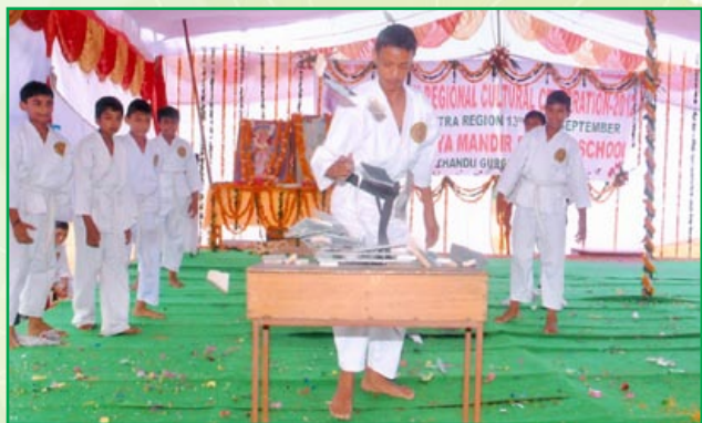
Student of MVM Gurgaon presenting Martial Art – Breaking marble tiles