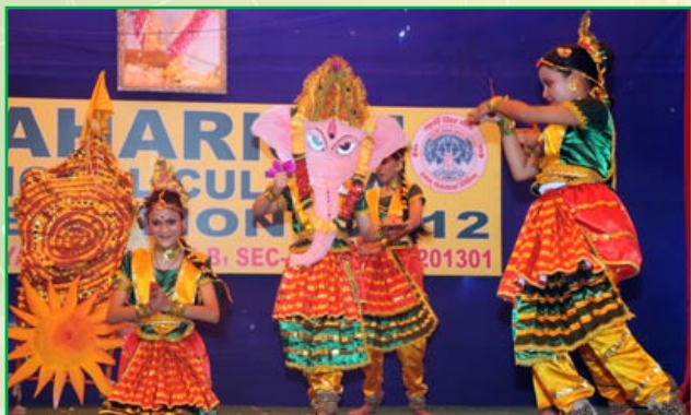
MVM students are performing 'Shri Ganesh Stuti' on the occasion of Maharishi Regional Cultural Celebration 2012