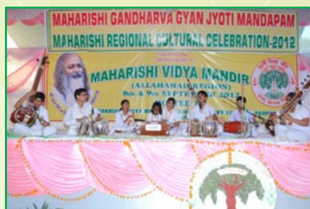
Photo Gallery of Regional Cultural Celebration, 9 th September 2012 (Second Day)