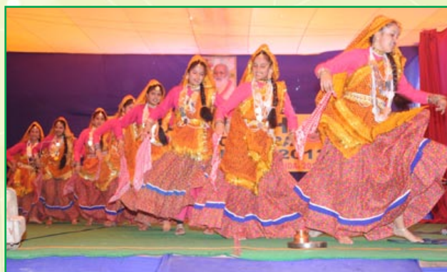
MVM students are performing folk dance on the occasion of Maharishi Regional Cultural Celebration 2012