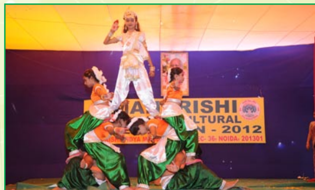
MVM students are performing drama on the occasion of Maharishi Regional Cultural Celebration 2012