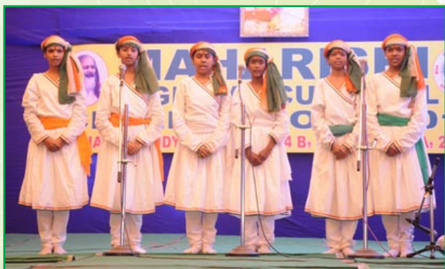
MVM students are presenting group song on the occasion of Maharishi Regional Cultural Celebration 2012