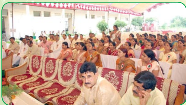
Hon'ble guests &amp; Audience are witnessing cultural programmes