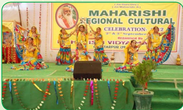
Group Dance Performed By Participants