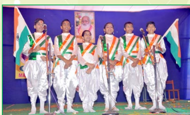
MVM students are presenting group song on the occasion of Maharishi Regional Cultural Celebration 2012