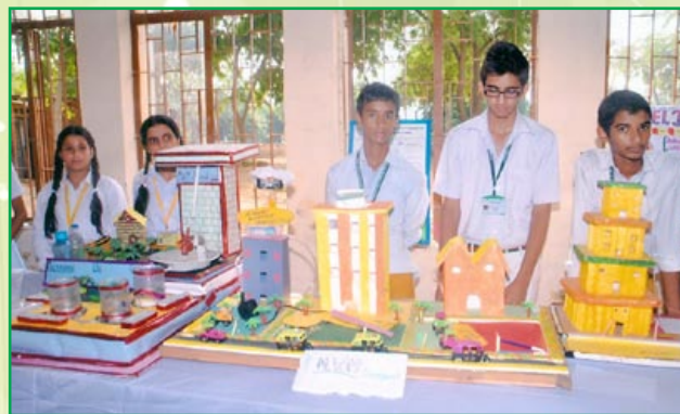
MVM students during the science exhibition with their models