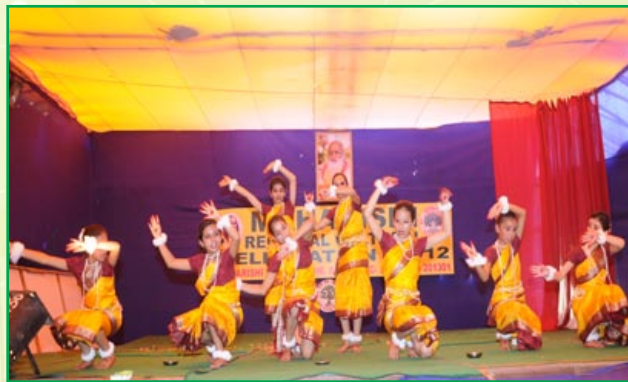
MVM students are presenting folk dance on the occasion of Maharishi Regional Cultural Celebration 2012