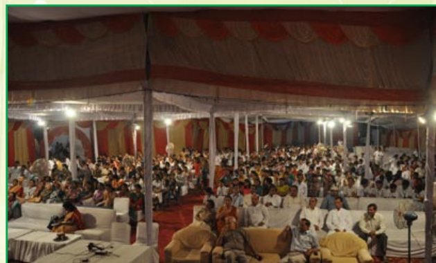
Hon'ble guests & Audience are witnessing cultural programmes