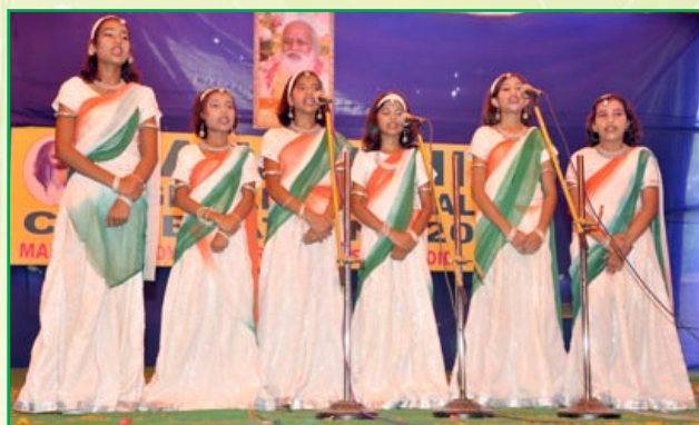
MVM students are presenting group song on the occasion of Maharishi Regional Cultural Celebration 2012