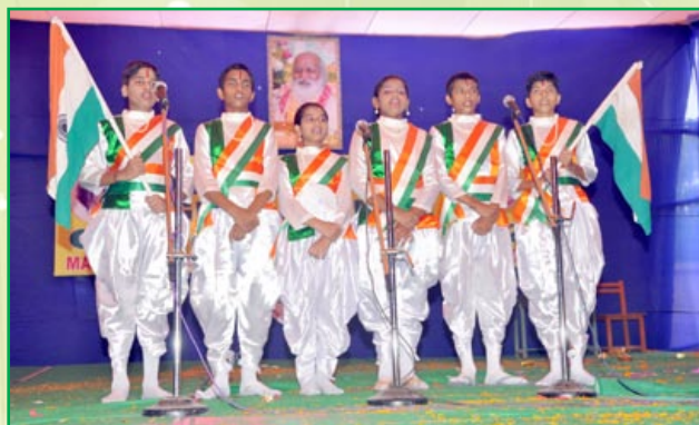
MVM students are presenting group song on the occasion of Maharishi Regional Cultural Celebration 2012