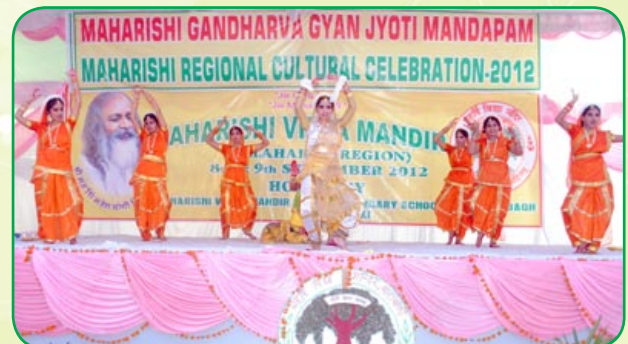
Photo Gallery of Regional Cultural Celebration, 8 th September 2012 (First Day)