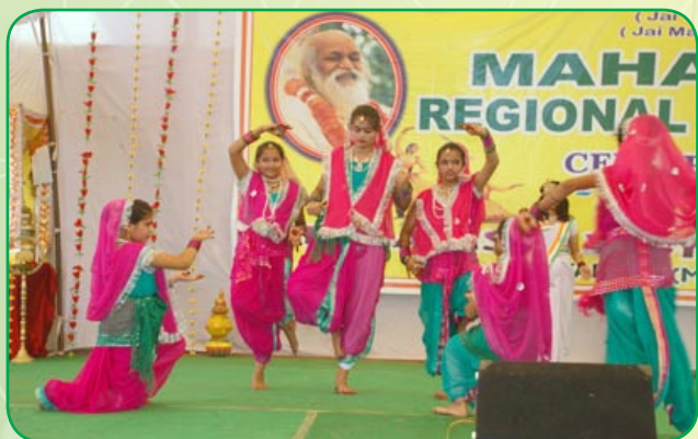
Group Dance Performed By Participants

The cultural celebration first began with Group dance (Senior) was full of zest & zeal which had enthralled the all viewers.