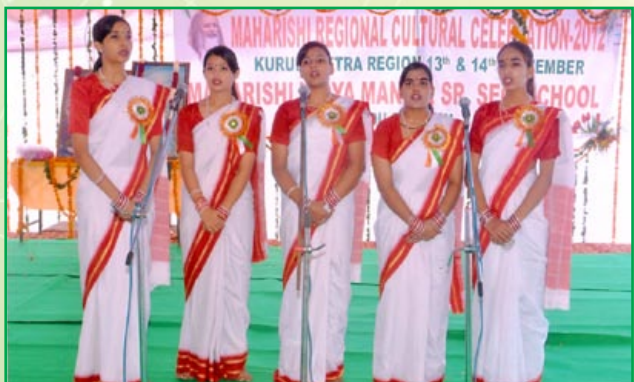
Students of MVM Gurgaon presenting Saraswati Vandana