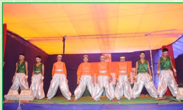
MVM students are performing group dance on the occasion of Maharishi Regional Cultural Celebration 2012