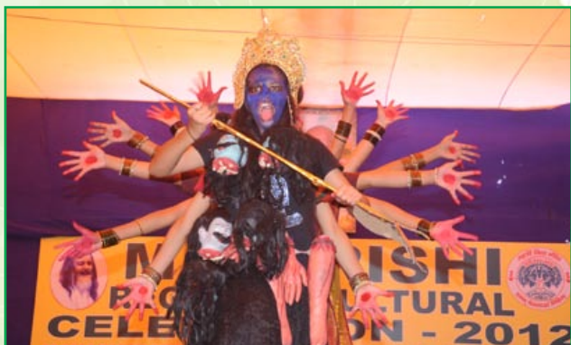
MVM students are performing religious play 'Maha-Kali' on the occasion of Maharishi Regional Cultural Celebration 2012