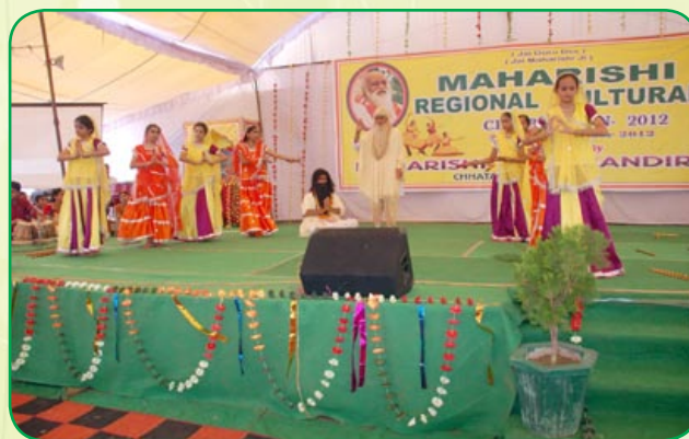
Group Dance Performed By Participants

The Science & Maths Exhibition was also organised.