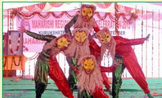
Students of MVM Yamuna Nagar performing play on female feticide