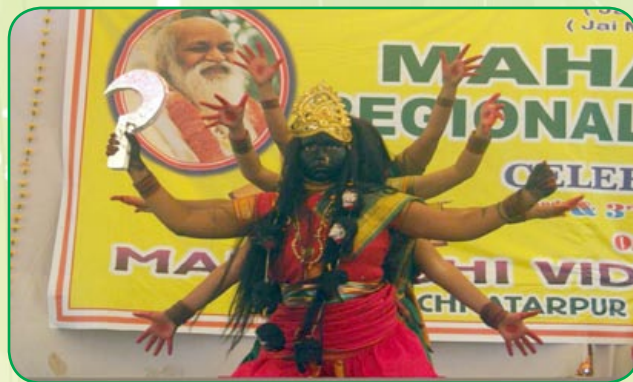
Dance Performed By Participants

The first day has ended with quiz competition which was full of knowledge and it had entertained all.