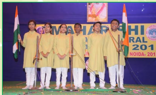
MVM students are presenting group song on the occasion of Maharishi Regional Cultural Celebration 2012