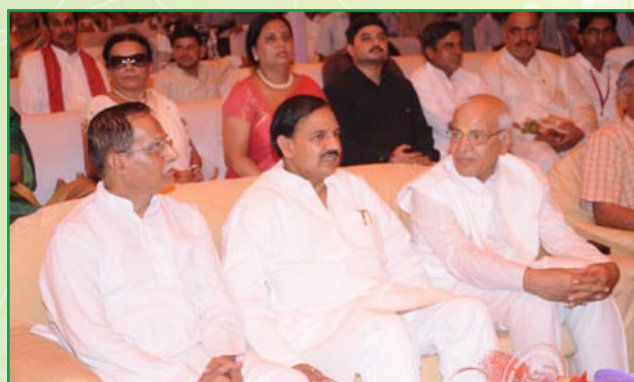
Hon'ble guests & Audience are witnessing cultural programmes