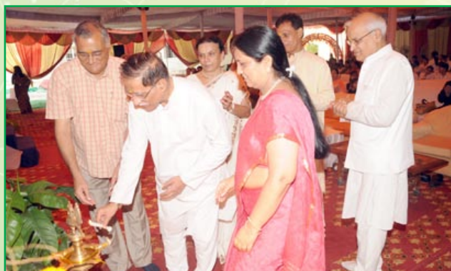
Members, Maharishi National Board of Directors are lighting the lamp on the occasion of Maharishi Regional Cultural Celebration 2012