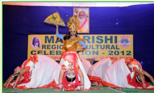
MVM students are performing 'Shri Krishna Leela' on the occasion of Maharishi Regional Cultural Celebration 2012