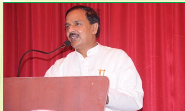
Dr. Mahesh Sharma, MLA, NOIDA is addressing on the occasion of Maharishi Regional Cultural Celebration 2012