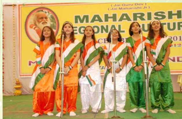
Group Song Performed by MVM Students

The dances presented by various schools were based on Vedic Themes and were remarkably eye openers.