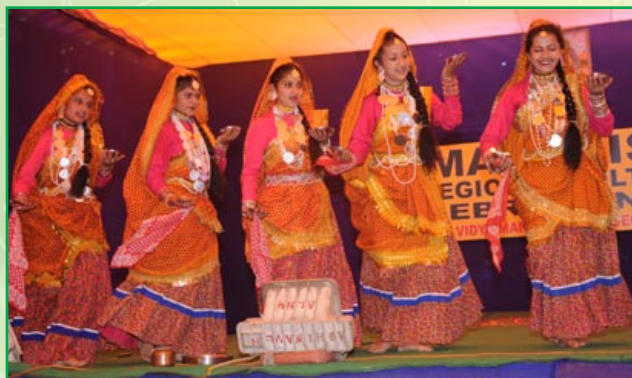
MVM students are performing group dance on the occasion of Maharishi Regional Cultural Celebration 2012