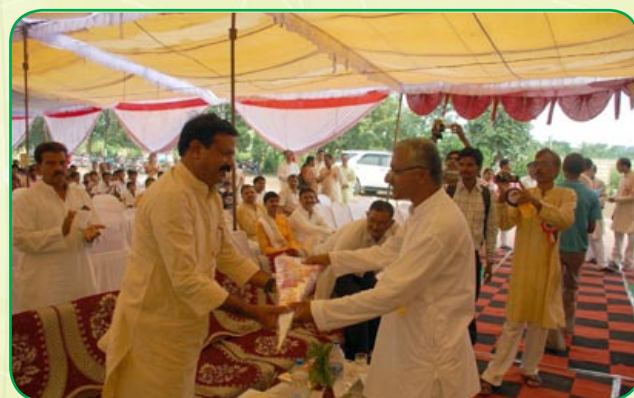
Chief Guest of Inaugural Ceremony, Shri Jitendra Singh Bundela, Member of Parliament, Khajuraho