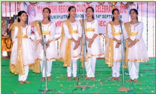
Students of MVM Gurgaon presenting a group song