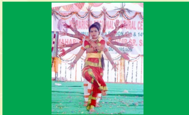
Students of MVM Gurgaon presenting a group song