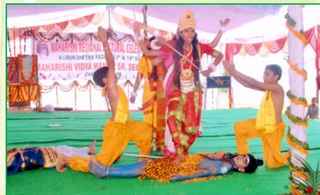
Students of MVM Kathua performing play on Mahisasur -Vadha