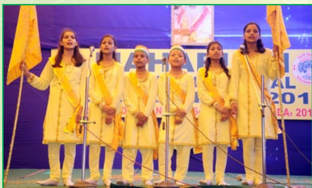
MVM students are presenting group song on the occasion of Maharishi Regional Cultural Celebration 2012