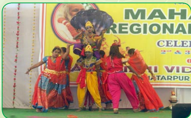
Group Dance Performed by MVM Students

The programme began with group dance (Junior) which energised and also mesmerised all viewers.