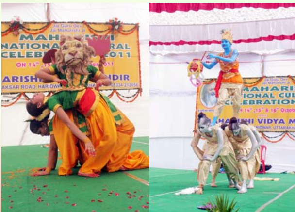
Students of Maharishi Vidya Mandir are performing " Hiranyakashyap Vadh " & ' Krishna Leela ' on the occasion of Maharishi National Cultural Celebration 2011