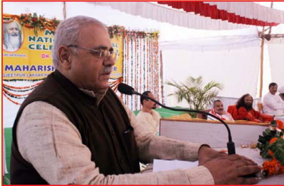
Shri Harbans Kapoor, Hon'ble Speaker, Uttarakhand Legislative Assembly addressing on the occasion of valedictory ceremony of Maharishi National Cultural Celebration

I always say, “Meditation is the best medication for all agitations. In this way, Maharishi Ji was not only a spiritual leader but he was also a spiritual doctor. By giving the power of meditation and mantra, he