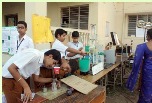
Students of Maharishi Vidya Mandir presenting their model in Science & Maths Exhibition