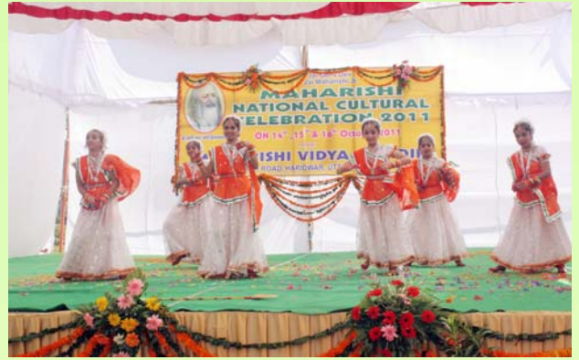
Students are performing folk dance on the occasion of Maharishi National Cultural Celebration 2011