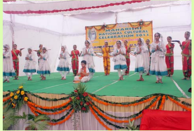
Students are performing Saraswati Vandana on the occasion of Maharishi National Cultural Celebration 2011