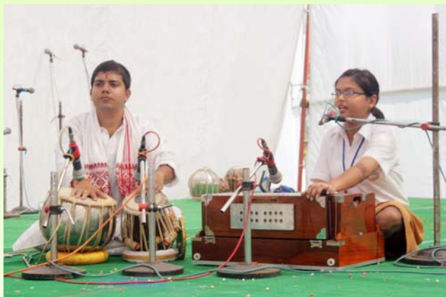
Students are performing 'Tabla & Harmonium Vaadan' on the occasion of Maharishi National Cultural Celebration 2011