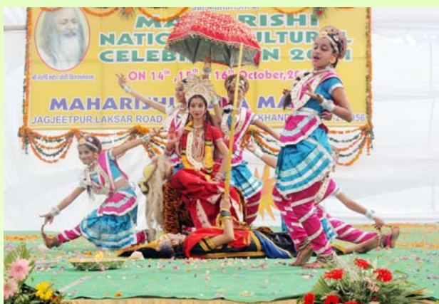
Students are presenting "Mahishasur Vadh" in a form of dance performances on the occasion of Maharishi National Cultural Celebration 2011