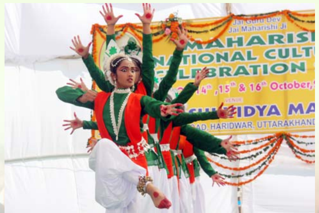
Students are performing folk dance on the occasion of Maharishi National Cultural Celebration 2011