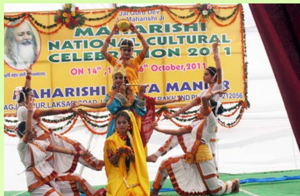
Students are presenting group dance on the occasion of Maharishi National Cultural Celebration 2011