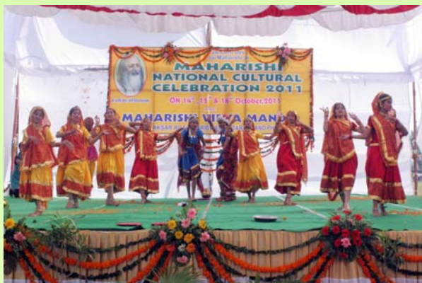
Students are presenting group dance on the occasion of Maharishi National Cultural Celebration 2011