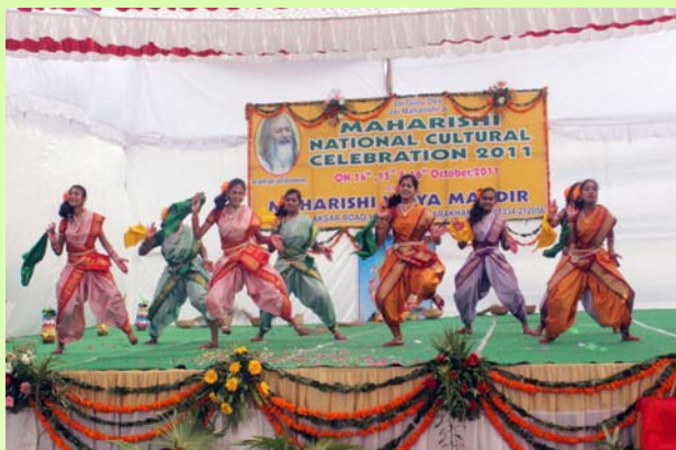
Students are presenting group dance on the occasion of Maharishi National Cultural Celebration 2011