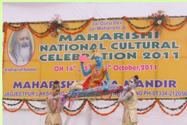
Students are presenting 'Lord Vishnu & Kalki Avtar' on the occasion of Maharishi National Cultural Celebration 2011