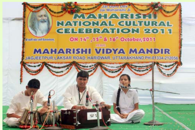
Students are performing 'Tabla & Harmonium Vaadan' on the occasion of Maharishi National Cultural Celebration 2011