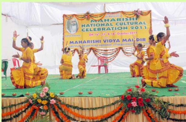
Students are presenting group dance performances on the occasion of Maharishi National Cultural Celebration 2011