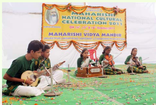
Students are presenting Musical performances on the occasion of Maharishi National Cultural Celebration 2011