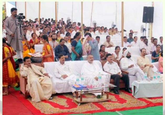
Hon'ble Guest & Audience witnessing cultural programmes on the occasion of Maharishi National Cultural Celebration 2011