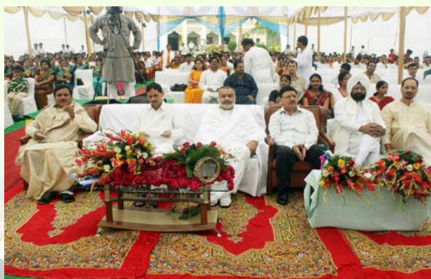
Hon'ble Guest & Audience witnessing cultural programmes on the occasion of Maharishi National Cultural Celebration 2011