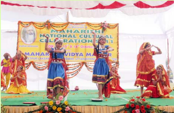
Students are performing group dance on the occasion of Maharishi National Cultural Celebration 2011