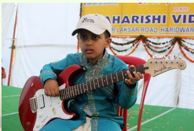
Student of Maharishi Vidya Mandir, Fatehpur performing 'Classical Guitar' on the occasion of Maharishi National Cultural Celebration 2011