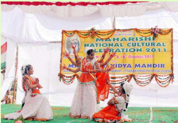
Students are presenting "Mahishasur Vadh" in a form of dance performances on the occasion of Maharishi National Cultural Celebration 2011