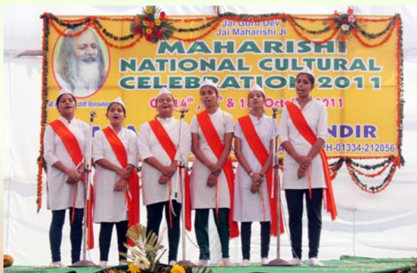
Students are presenting group song on the occasion of Maharishi National Cultural Celebration 2011