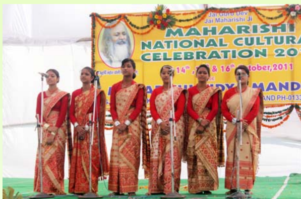
Students are presenting group song on the occasion of Maharishi National Cultural Celebration 2011