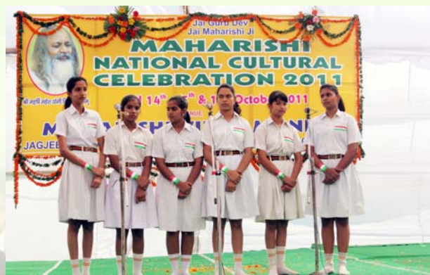
Students are presenting group song on the occasion of Maharishi National Cultural Celebration 2011