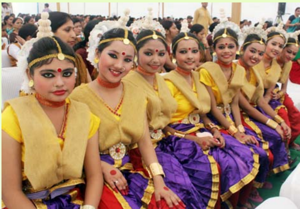
MVM students & performers are witnessing on the occasion of Maharishi National Cultural Celebration 2011