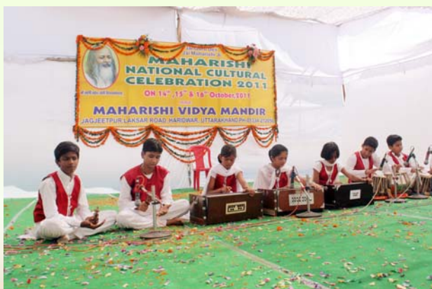
Students are presenting Musical performances on the occasion of Maharishi National Cultural Celebration 2011