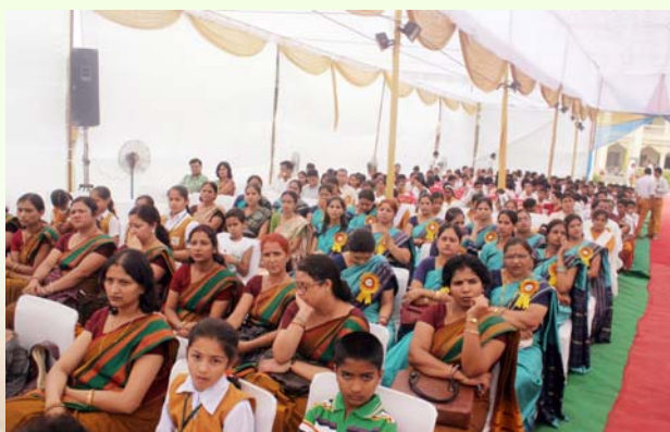
Audience witnessing cultural programmes on the occasion of Maharishi National Cultural Celebration 2011