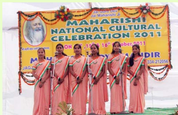
Students are presenting group song on the occasion of Maharishi National Cultural Celebration 2011