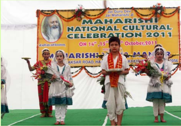
Students are performing Kumavni Dance on the occasion of Maharishi National Cultural Celebration 2011