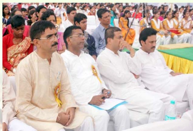
Audience witnessing cultural programmes on the occasion of Maharishi National Cultural Celebration 2011