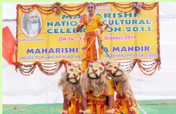
Students are presenting 'Bharat Mata' performances on the occasion of Maharishi National Cultural Celebration 2011