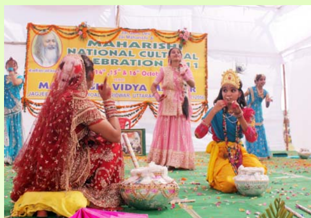
Students are performing "Krishna Leela" on the occasion of Maharishi National Cultural Celebration 2011