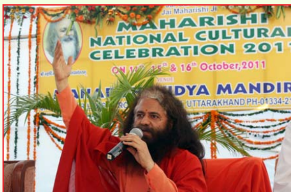
His Holiness Pujya Swami Chidanand Saraswati Ji addressing on the occasion of valedictory ceremony of Maharishi National Cultural Celebration 2011

Pujya Swami Chidanand Saraswati Ji in his Message during concluding session said that “His Holiness Brahmaleen Maharishi Mahesh Yogi Ji was Maharishi in the truest sense. One of the greatest spiritual teachers of this era, he was an ambassador for Indian culture and knowledge in the world, the epitome of world brotherhood, and an extraordinary union of the Vedic tradition and the modern scientific knowledge. A phenomenon such as this can be completely evaluated only in the future. Maharishi Mahesh Yogi Ji is the first and only Indian philosopher who established in the West