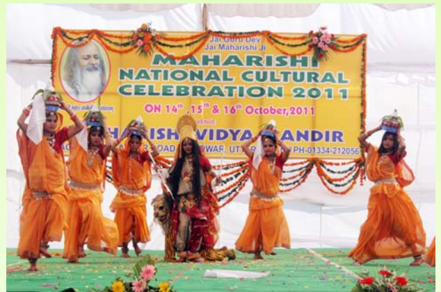
Students are presenting "Durga Stuti" on the occasion of Maharishi National Cultural Celebration 2011