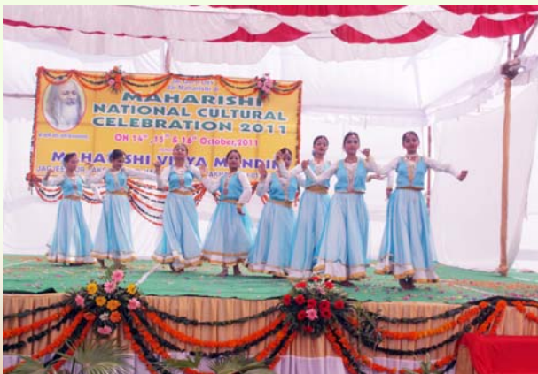
Students are performing group dance on the occasion of Maharishi National Cultural Celebration 2011