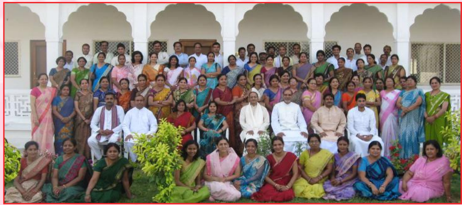
1st batch of Maharishi Vidya Mandir Teacher's Refresher Course on Transcendental Meditation & Sidhi Programme, Brahmsthan of India from 4th to 10th April 2012

The first course began on 4th April 2012. The courses will be continuing till 29th June 2012. The seventy six participants reported for the first