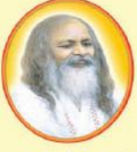
पूज्य महर्षि महेश योगी