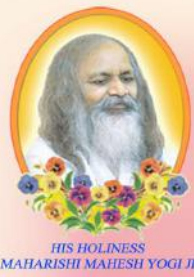
HIS HOLINESS MAHARISHI MAHESH YOGI JI