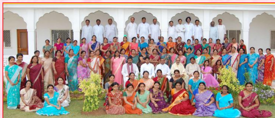
2nd batch of Maharishi Vidya Mandir Teacher's Refresher Course on Transcendental Meditation & Sidhi Programme, Brahmsthan of India from 12th to 18th April 2012

course. There were 25 male and 56 female. They also witnessed Maha Rudrabhishek performed by 121 Vedic Pandits. Most of the teachers expressed that it is their life time experience and achievement.