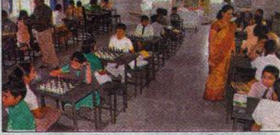
महर्षि विद्या मंदिर में शतरंज प्रतियोगिता में शामिल विद्यार्थी।