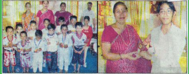
महर्षि स्कूल के मेधावी बच्चे प्राचार्या के साथ।