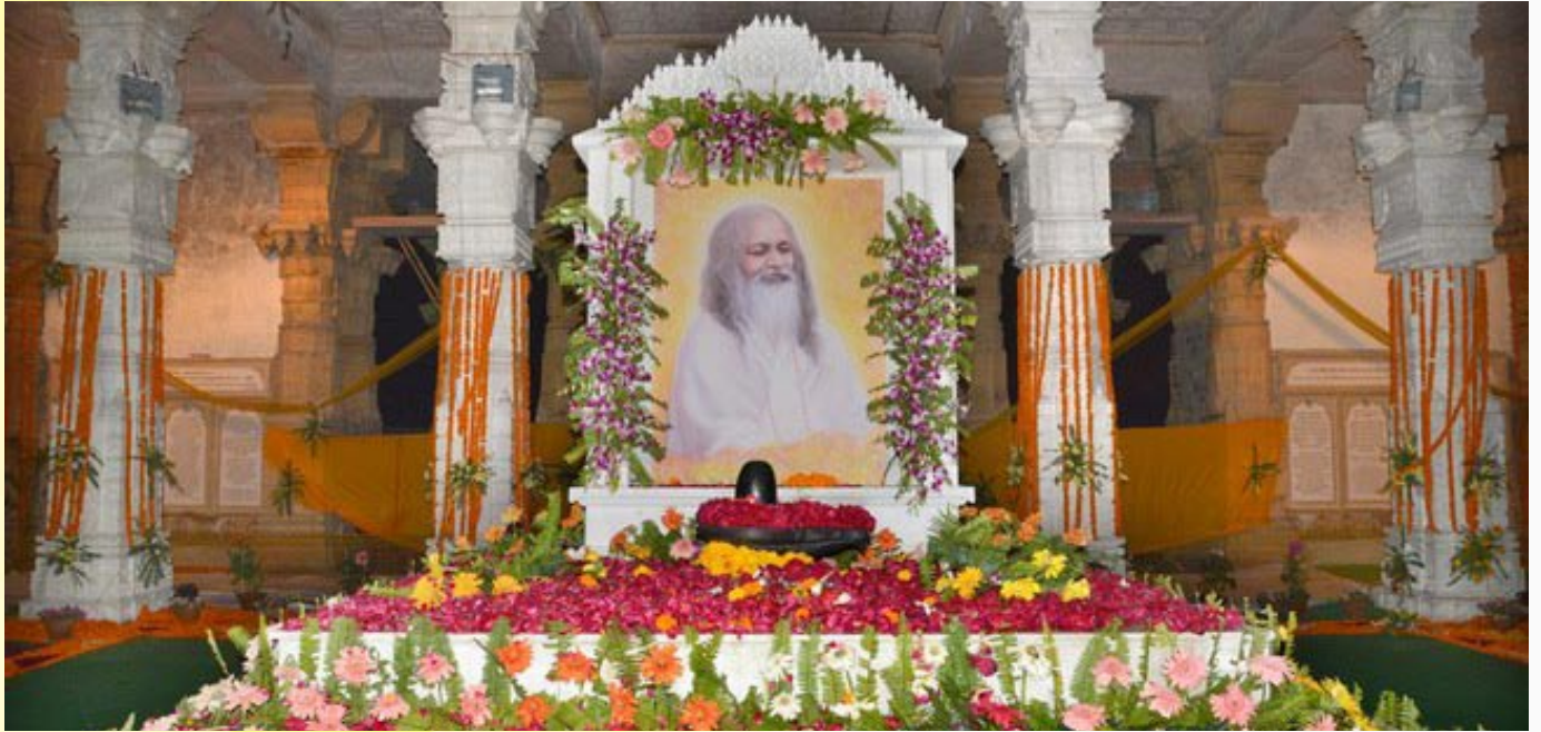
Maharishi Smarak in the evening with celestial golden light. 15 February 2013, Basant Panchmi

On Friday, 15 th February, the grand inauguration of the Maharishi Smarak, a memorial of Total Knowledge, was held during the auspicious Maha Kumbh Mela, an important spiritual gathering occurring once in 144 years at Prayag (Allahabad), India. A large assembly gathered at the Maharishi Smarak to celebrate the eternal Vedic wisdom brought to the world by Maharishi Mahesh Yogi Ji, Founder of the Transcendental Meditation programme and the Global Country of World Peace.