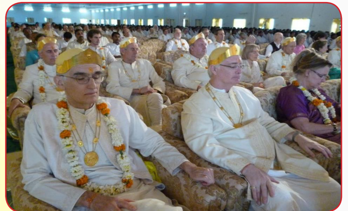
Rajas, Ministers of Maharishi Global Country of World Peace and other leaders of Maharishi Global Movement enjoying Atirudrabhishek on 23 February 2013 at Brahms than of India.