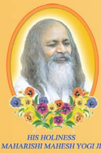
HIS HOLINESS MAHARISHI MAHESH YOGI JI