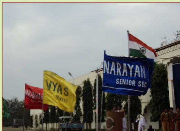
26 th January 2012 The Republic Day celebration