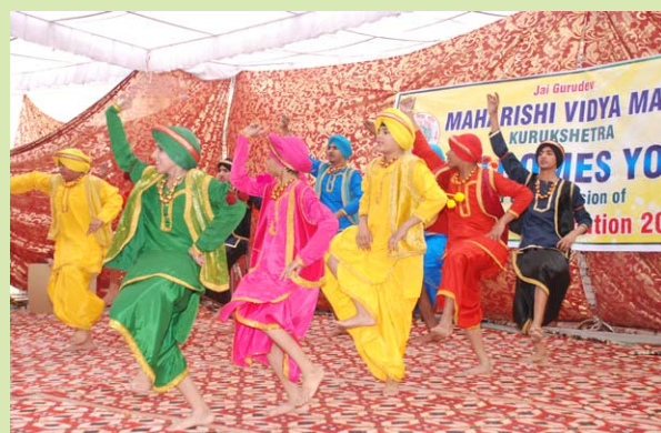
ज्ञान युग दिवस के अवसर पर सामूहिक नृत्य प्रस्तुत करते हुए, महर्षि विद्या मन्दिर कुरुक्षेत्र के छात्र।