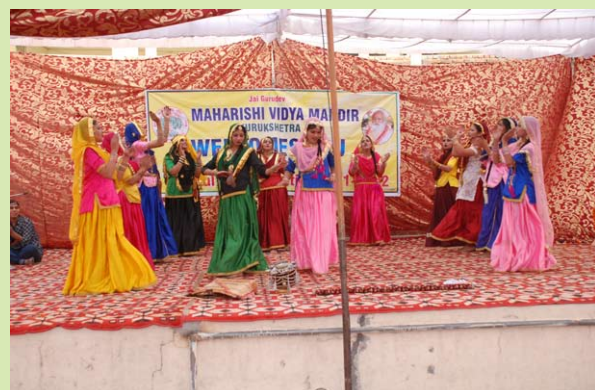
ज्ञान युग दिवस के अवसर पर सामूहिक नृत्य प्रस्तुत करती हुई, महर्षि विद्या मन्दिर कुरुक्षेत्र की छात्राएँ।