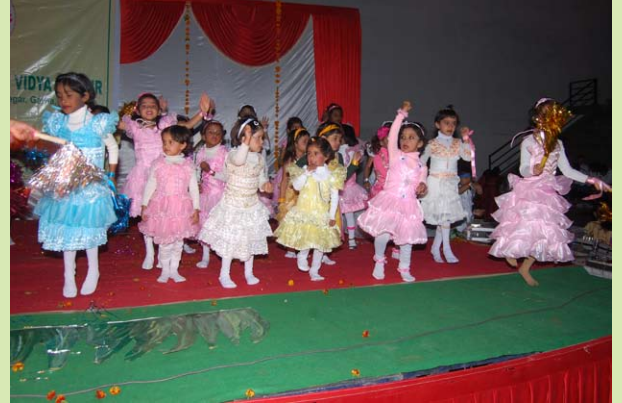
सामूहिक नृत्य प्रस्तुत करते हुये, महर्षि विद्या मन्दिर के विद्यार्थी