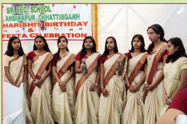
Students of Maharishi Vidya Mandir Ambikapur presenting group song on the occasion of Gyan Yug Diwas