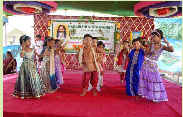
Students presenting group dance on the occasion of Gyan Yug Diwas & Annual Day Celebration