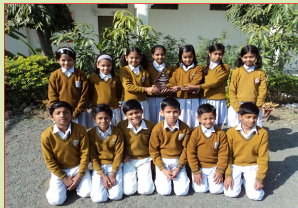
Group Song Winner