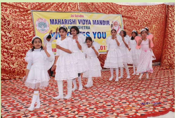
ज्ञान युग दिवस के अवसर पर सामूहिक नृत्य प्रस्तुत करती हुई, महर्षि विद्या मन्दिर कुरुक्षेत्र की छात्राएँ।