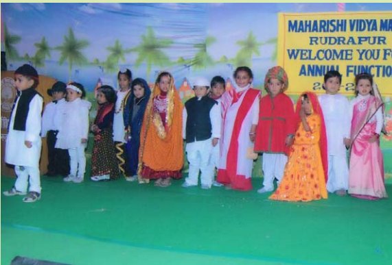
विभिन्न प्रादेशिक वेश-भूषाओं में महर्षि विद्या मन्दिर रुद्रपुर के विद्यार्थी

कार्यक्रम के अन्त में विद्यार्थियों ने भावातीत ध्यान की उपयोगिता पर आधारित एक लघु नाटिका प्रस्तुत की, जो सराहनीय रही। कार्यक्रम का समापन राष्ट्रीय गीत के साथ हुआ।