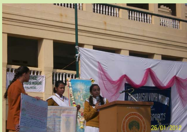
Maharishi Consciousness Based Education Presentation by students