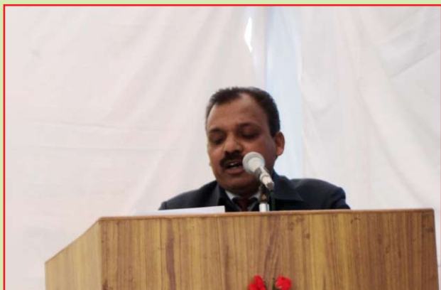
Principal, Maharishi Vidya Mandir, Ambikapur addressing on the occasion of Gyan Yug Diwas