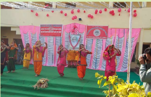
Students presenting group dance on the occasion Gyan Yug Diwas Celebration