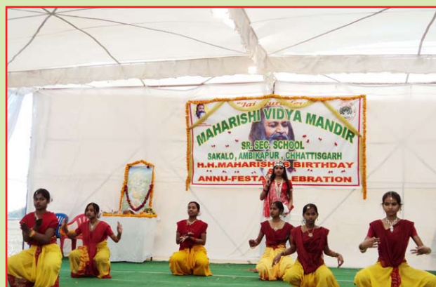
Students of Maharishi Vidya Mandir Ambikapur presenting group dance on the occasion of Gyan Yug Diwas