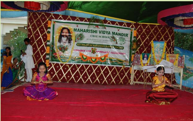
Students presenting group dance on the occasion of Gyan Yug Diwas & Annual Day Celebration