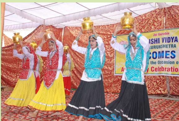
ज्ञान युग दिवस के अवसर पर सामूहिक नृत्य प्रस्तुत करती हुई, महर्षि विद्या मन्दिर कुरुक्षेत्र की छात्राएँ।