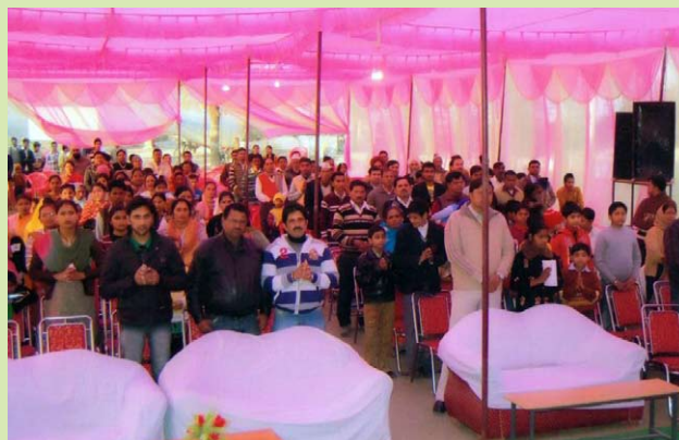
वार्षिक महोत्सव के अवसर पर उपस्थित जनसमूह