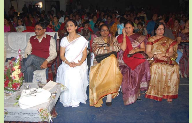
ज्ञान युग दिवस, समारोह पर उपस्थित जनसमूह