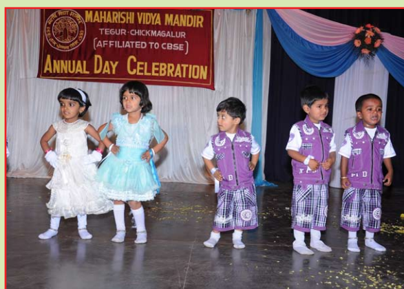
Students presenting group dance on the occasion of Gyan Yug Diwas & Annual Day Celebration