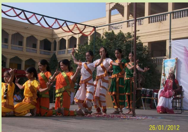
Students presenting "Saraswati Vandana"