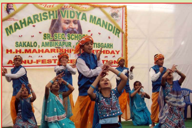
Students of Maharishi Vidya Mandir Ambikapur presenting group dance on the occasion of Gyan Yug Diwas