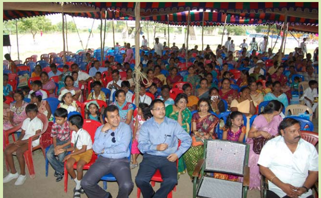
Audience witnessing the cultural programme