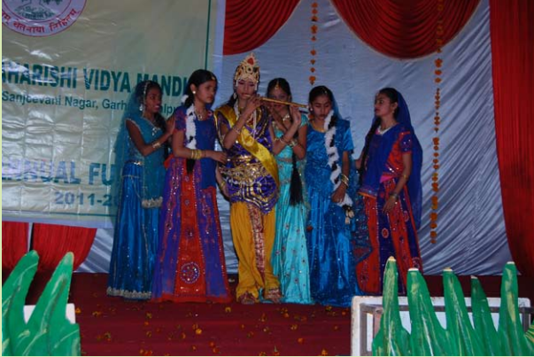
ज्ञान युग दिवस के अवसर पर 'कृष्ण लीला' प्रस्तुत करते हुयीं, महर्षि विद्या मन्दिर के छात्राएँ।

महर्षि विद्या मन्दिर जबलपुर-४ में महर्षि जी का जन्म दिवस ज्ञान युग दिवस के रूप में बड़े ही हर्षोउल्लास के साथ मनाया गया। कार्यक्रम का प्रारम्भ दीप प्रज्ज्वलन एवं गुरु पूजन के साथ किया गया। विद्यार्थियों ने विभिन्न सांस्कृतिक कार्यक्रमों में भाग लेकर प्रभावपूर्ण प्रस्तुती से अतिथिगणों, अभिभावकों व जनसमूह को मंत्रमुग्ध कर दिया।