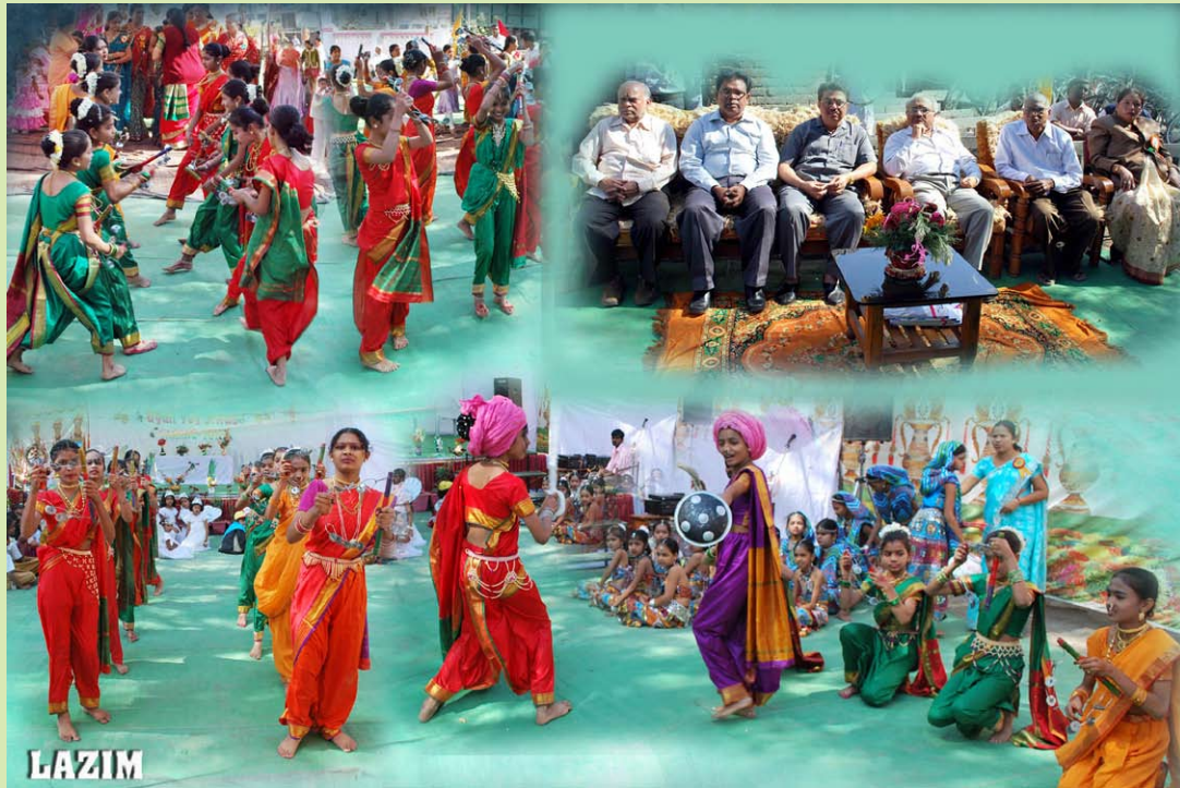
Students presenting group dance on the occasion Gyan Yug Diwas Celebration