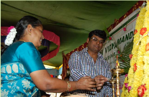
Chief Guest lighting the lamp on the occasion of Gyan Yug Diwas & Annual Day Celebration