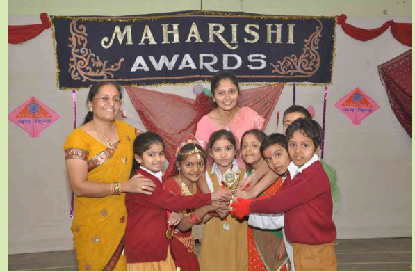
पुरस्कार विजेता छात्र, प्राचार्या महर्षि विद्या मन्दिर, पोरबंदर (गुजरात) के साथ