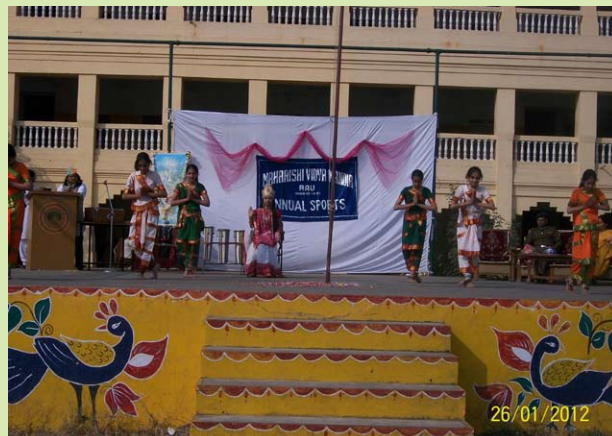
Students presenting Group Dance