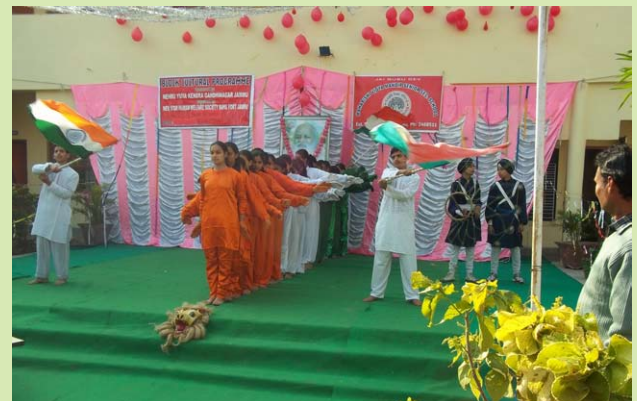
Students presenting group dance on the occasion Gyan Yug Diwas Celebration