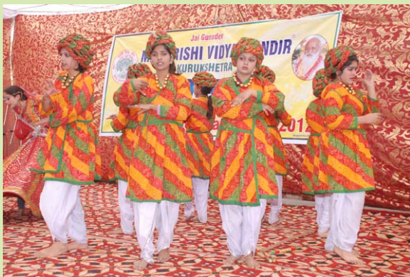
ज्ञान युग दिवस के अवसर पर सामूहिक नृत्य प्रस्तुत करते हुए, महर्षि विद्या मन्दिर कुरुक्षेत्र के छात्र-छात्राएँ।