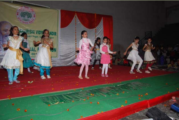
सामूहिक नृत्य प्रस्तुत करते हुये, महर्षि विद्या मन्दिर के विद्यार्थी