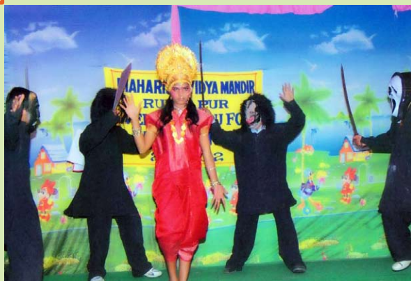
पौराणिक लोक कथाओं पर आधारित नृत्य-नाटिका प्रस्तुत करते हुए, महर्षि विद्या मन्दिर रुद्रपुर के विद्यार्थी