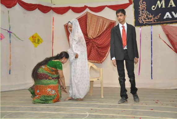
ज्ञान युग दिवस के अवसर पर सांस्कृतिक कार्यक्रम प्रस्तुत करते हुये, महर्षि विद्या मन्दिर पोरबंदर के विद्यार्थी

महर्षि विद्या मन्दिर पोरबंदर में ज्ञान युग दिवस के अवसर पर विभिन्न सांस्कृतिक कार्यक्रम प्रस्तुत किये गये। इस अवसर पर विद्यार्थियों को सम्मानित किया गया।