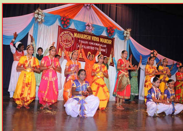
Students presenting group dance on the occasion of Gyan Yug Diwas & Annual Day Celebration