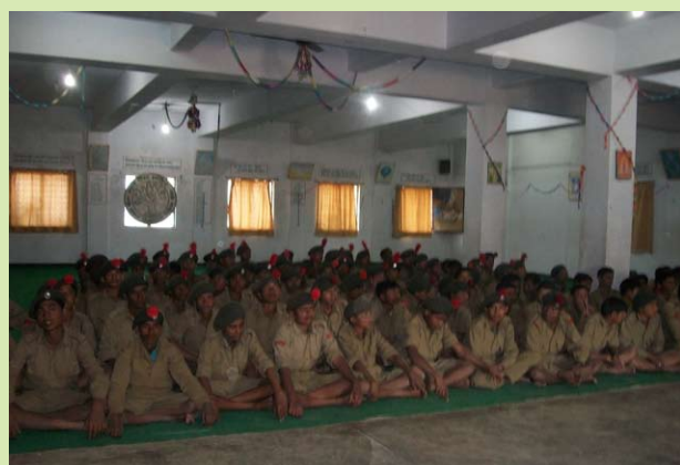
NCC Cadets of Maharishi Vidya Mandir, Indore