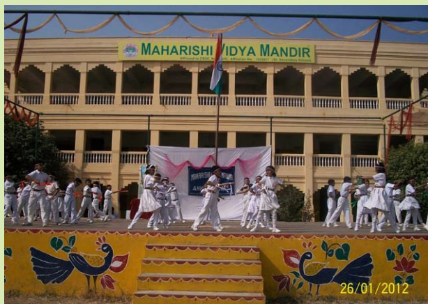
Students presenting Group Dance

Republic Day Celebration 26 th January 2012