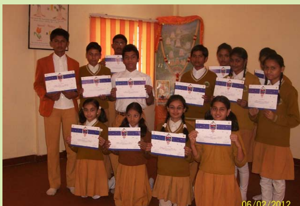
Students of MVM Indore, Rank Holders Spell Bee Competition conducted by Times of India