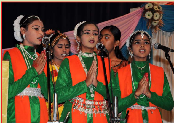
Students of MVM Chikmagalur performing Guru Pujan on the occasion of Gyan Yug Diwas & Annual Day Celebration