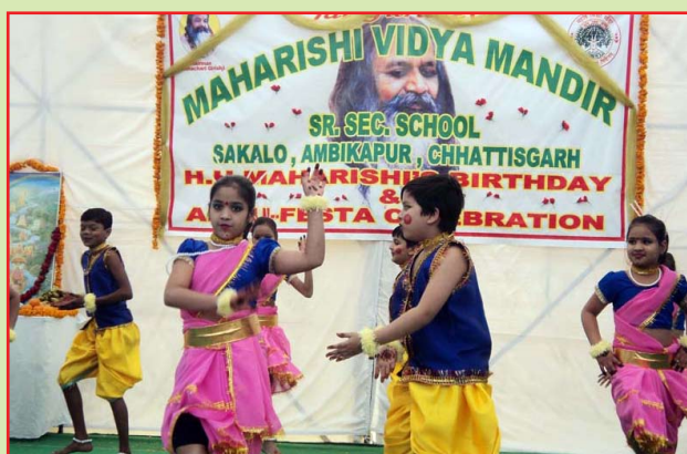
Students of Maharishi Vidya Mandir Ambikapur presenting group dance on the occasion of Gyan Yug Diwas