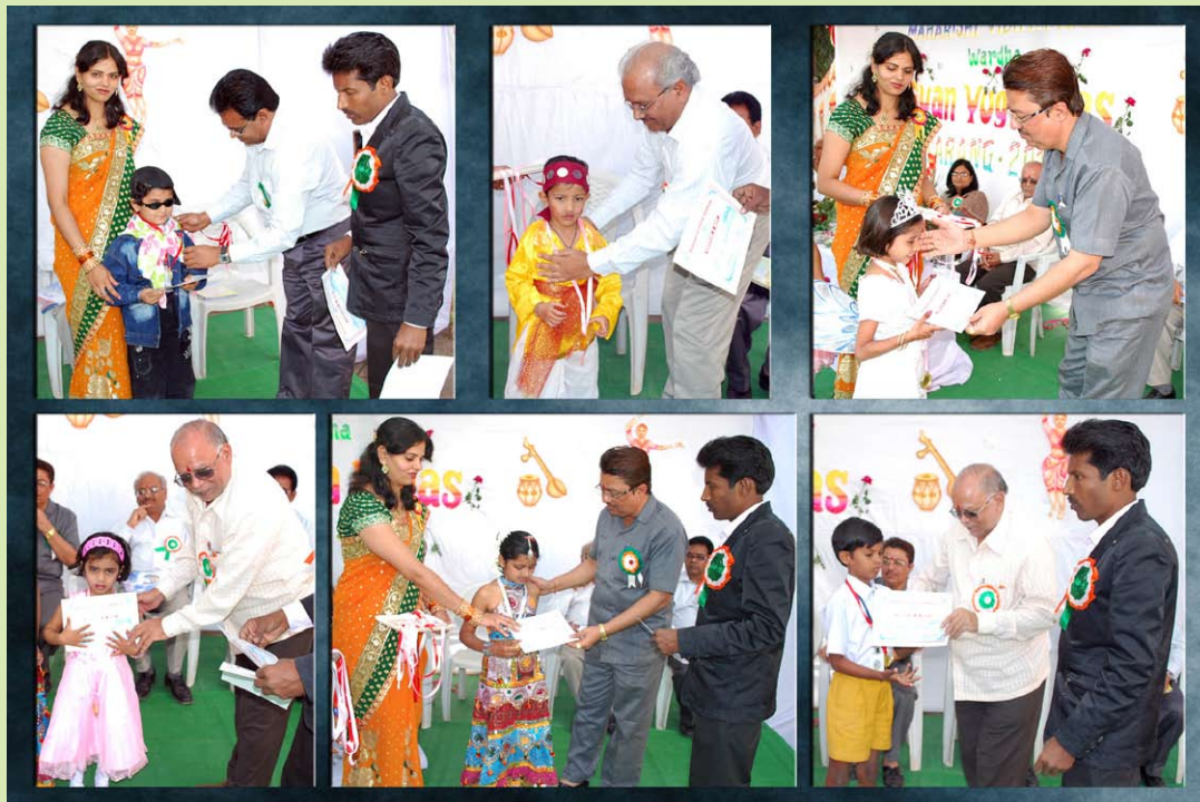
Award Winning Students