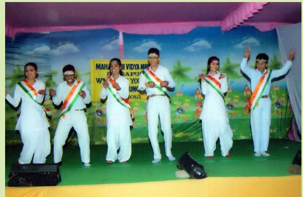
देश भक्ति गीत पर नृत्य प्रस्तुत करते हुए, महर्षि विद्या मन्दिर रुद्रपुर के विद्यार्थी