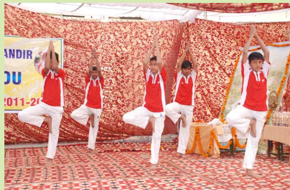
ज्ञान युग दिवस के अवसर पर योग की विभिन्न मुद्राओं को प्रस्तुत करते हुये महर्षि विद्या मन्दिर कुरुक्षेत्र के विद्यार्थी।