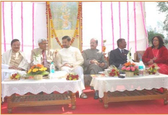
Chief Guest and other dignitaries are present on Annual Sports Day 2010