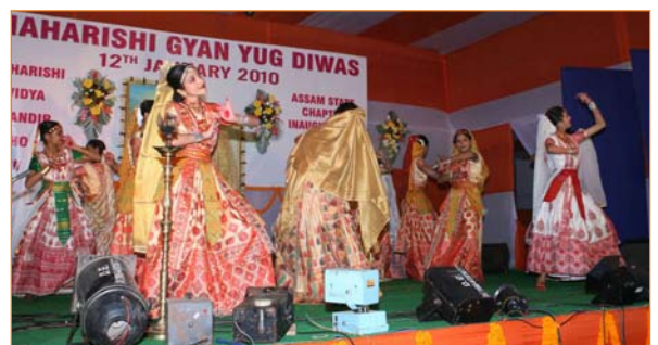
Students of MVMs Guwahati are performing group dance