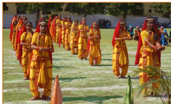
Students are performing group dance on the occasion of Annual Sports Day