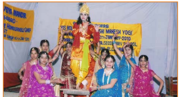
Students of MVM Naini presenting Krishna Leela