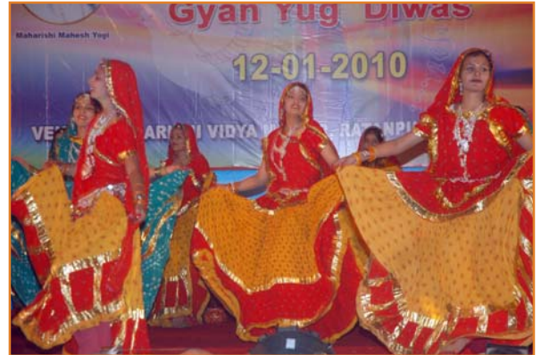
Students of MVM Ratanpur are performing group dance