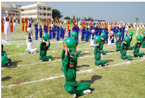
Students of MCEE, Bhopal are performing sports drills on the Annual Sports Day