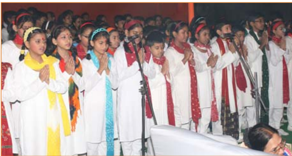
Students of MVMs Guwahati are presenting group song