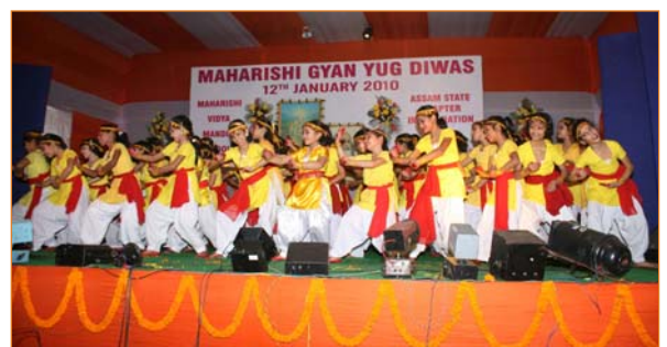
Students of MVMs Guwahati are performing group dance