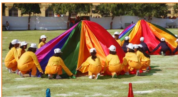
Students are performing on the occasion of Annual Sports Day