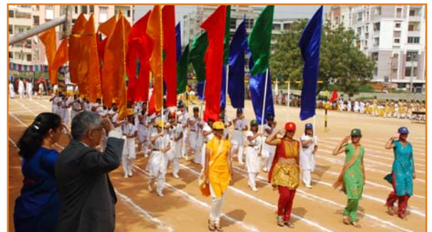
Flag March by students of MVM Hyderabad