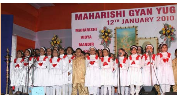
Students of MVMs Guwahati are presenting group song