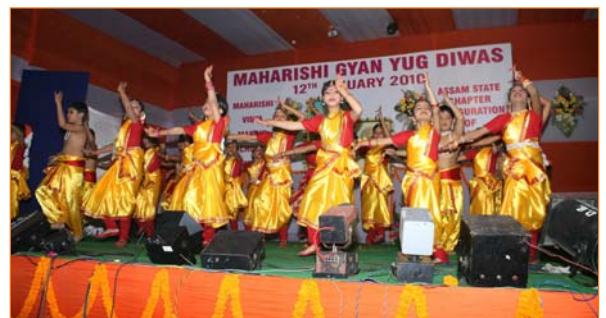
Students of MVMs Guwahati are performing group dance