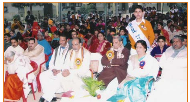
Staff, Students and audience witnessing of cultural programmes on Gyan Yug Diwas celebration