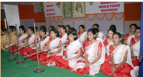
Students of MVMs Guwahati are presenting Saraswati Vandana