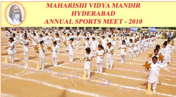
Students of MVM Hyderabad celebrating Annual Sports Day