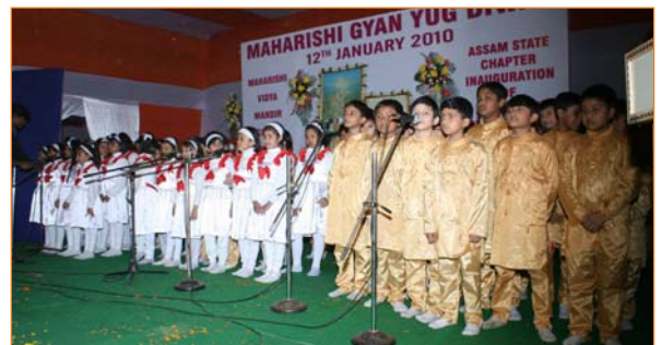
Students of MVMs Guwahati are presenting group song