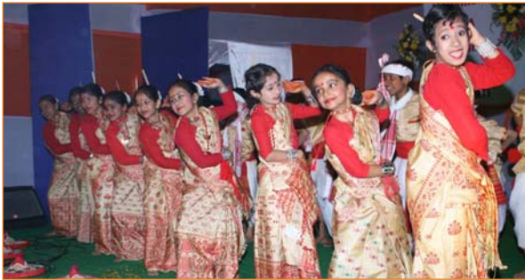
Students of primary wing of MVM-II Guwahati are performing Bihu dance