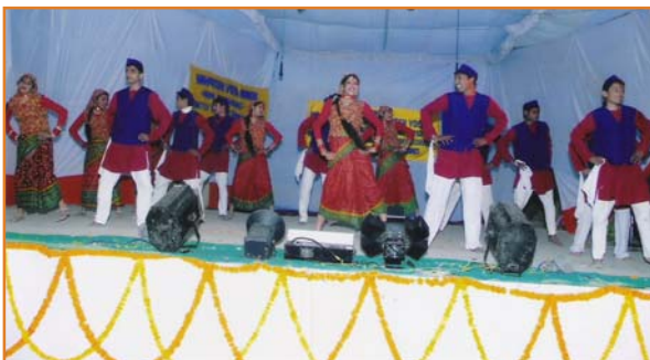
Students of MVM Naini performing Folk Dance