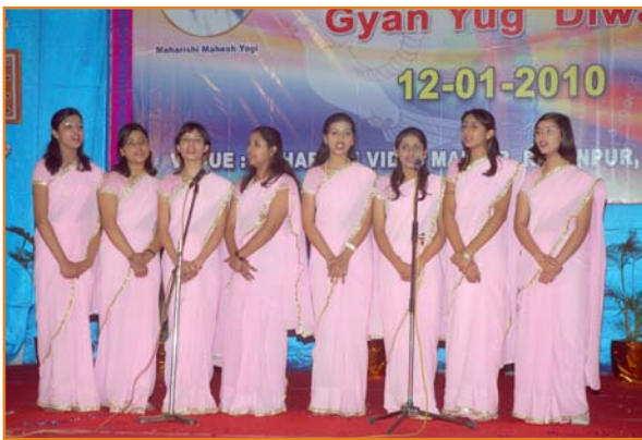
Students of MVM Ratanpur are presenting group song