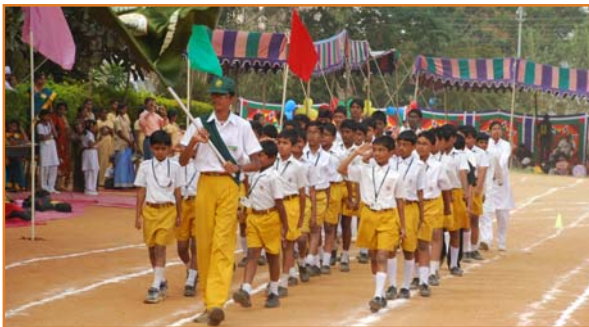
March Pass by students of MVM Hyderabad