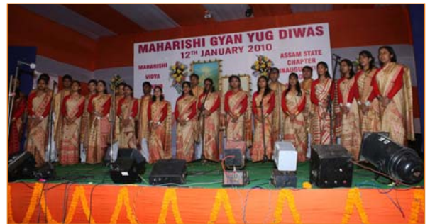
Students of MVMs Guwahati are presenting group song