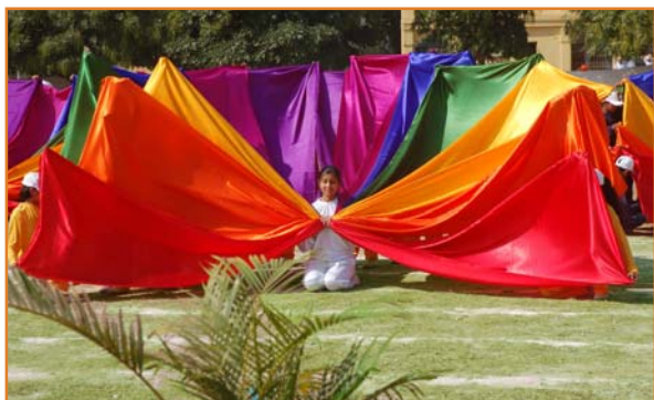
Students are performing on the occasion of Annual Sports Day