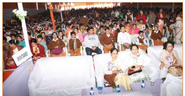
Audience witnessing cultural programme on Gyan Yug Diwas