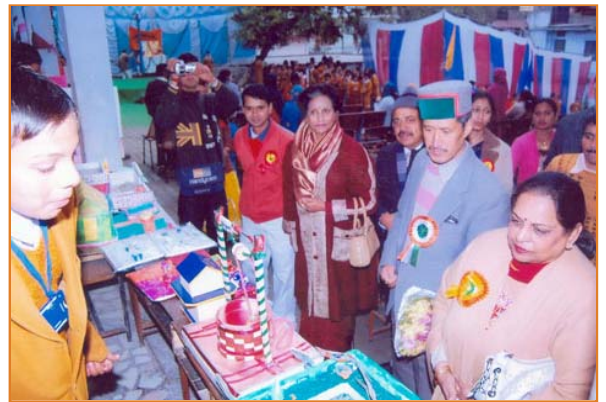
Arts & Crafts exhibition presented by students of MVM Kangra on the occasion of Gyan Yug Diwas