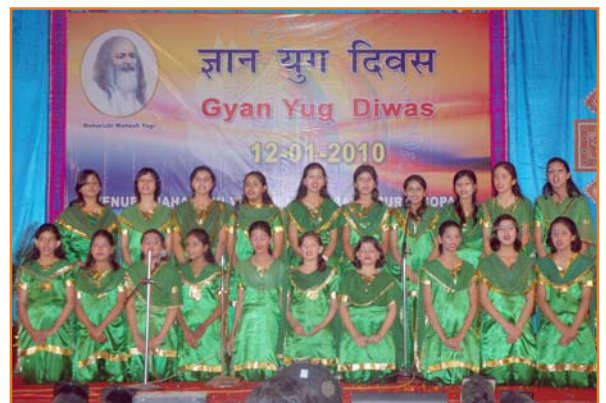
Students of MVM Ratanpur are presenting group song