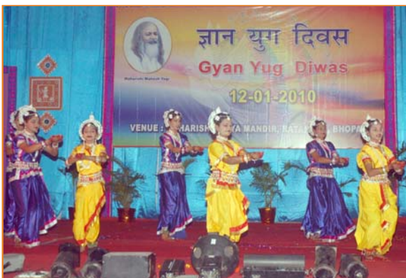
Students of MVM Ratanpur are performing group dance