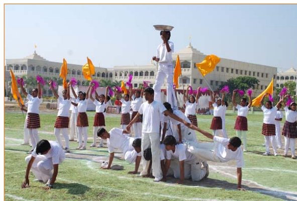
P.T. Show by Students of MCEE, Bhopal