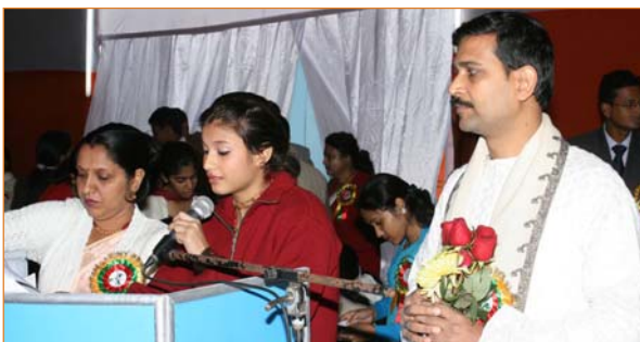
Masters of ceremony are conducting programmes