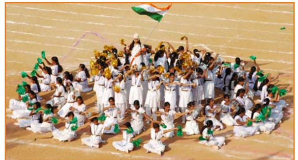
Students of MVM Hyderabad performing presentation on patriotic song on Annual Sports Day