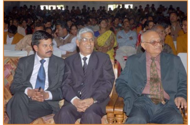
Audience witnessing programmes on the occasion of Gyan Yug Diwas