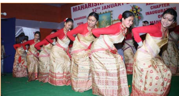
Students of MVMs Guwahati are performing folk dance