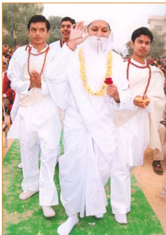
Students of MVM – I, Aligarh performing Ved - Leela on the occasion of Gyan Yug Diwas