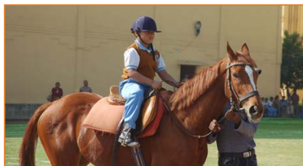
Horse Riding show by Student of MVM Ratanpur