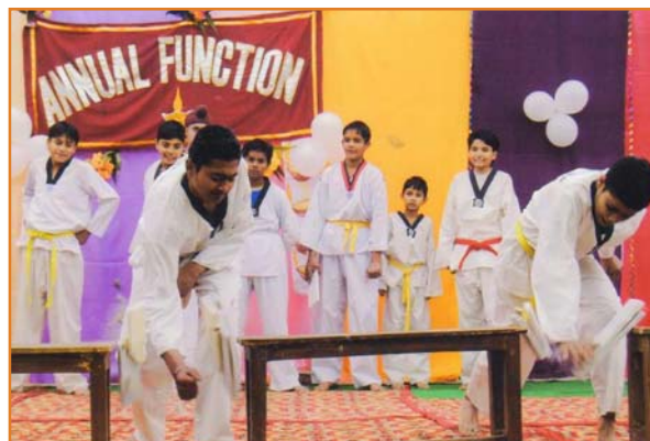
Students of MVM Jind presenting Martial arts