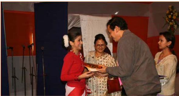
Student of MVM - I Guwahati receiving Award