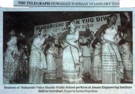
Students of Maharishi Vidya Mandir Public School perform at Assam Engineering Institute field in Guwahati.