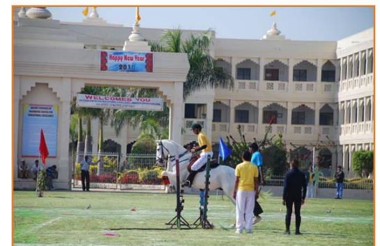
Horse Riding show

The whole programme was bound with crisp anchoring and proper flow of events and Prize Distribution. The function concluded with felicitation of students and teachers, folding of the flag and followed by National Anthem.