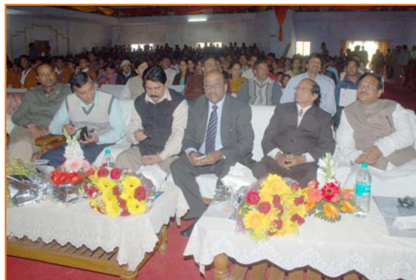
Dignitaries are witnessing cultural programmes on the occasion of Gyan Yug Diwas