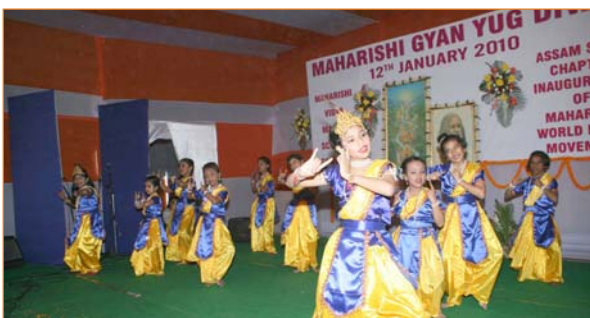
Students of MVMs Guwahati are presenting Krishna Leela