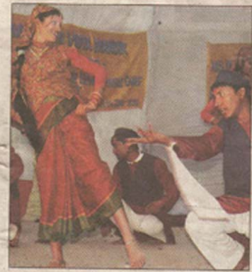
महर्षि महेश योगी के जन्म दिन पर आयोजित प्रोग्राम में परफार्मेंस देने महर्षि विद्या मंदिर के बच्चे।

ALLAHABAD(12 Jan) : रविवार पर एक के बाद एक स्टूडेंट्स की बेहतरीन परफार्मेंस को देखकर हर दर्शक शालिश बचाने को मजबूर हो रहा था. स्टूडेंट्स को देखकर लग रहा था कि उन्होंने प्रोग्राम के लिए बहने वाली गहनता की है. महर्षि महेश योगी के जन्म दिवस के अवसर पर महर्षि विद्या मंदिर, नैनी कैम्पस में चल रहे कार्यक्रम प्रोग्राम का नवाब कुल ऐस हो था. इस दौरान सबसे ज्यादा एंजॉयमेंटल गरीबी और के-सी स्टूडेंट्स इन "दिल से रंग कुकी चंचाम डी" गाने पर किए गए डांस को मिला.