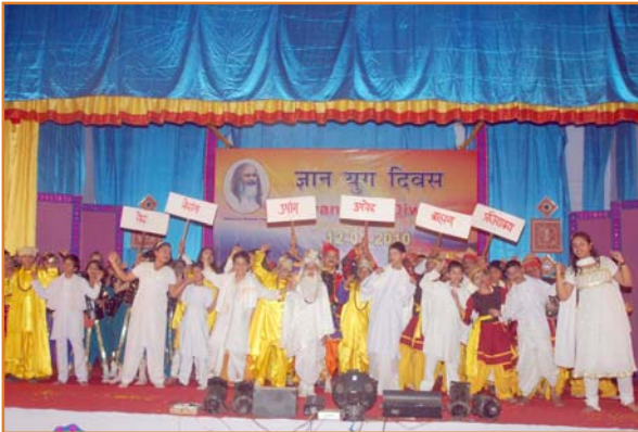
Students of MVM Ratanpur are presenting Programme on concept of Vedic Knowledge