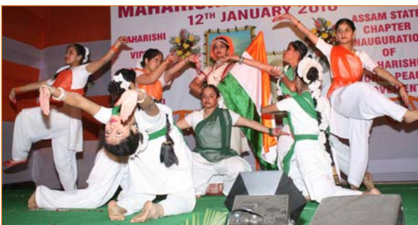
Students of MVMs Guwahati are performing group dance