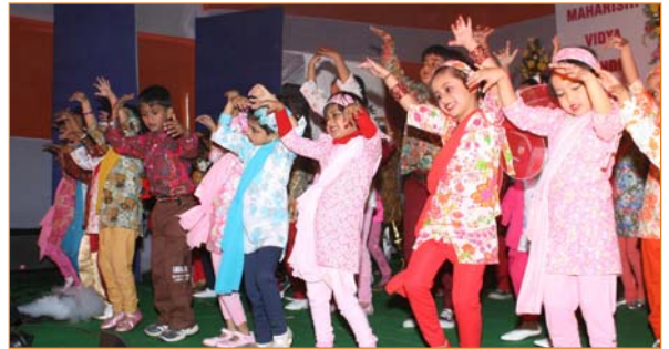
Students of MVMs Guwahati are performing group dance