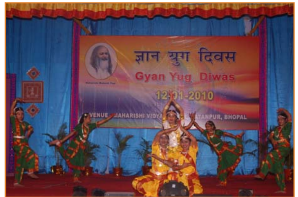
Students of MVM Ratanpur are performing group dance