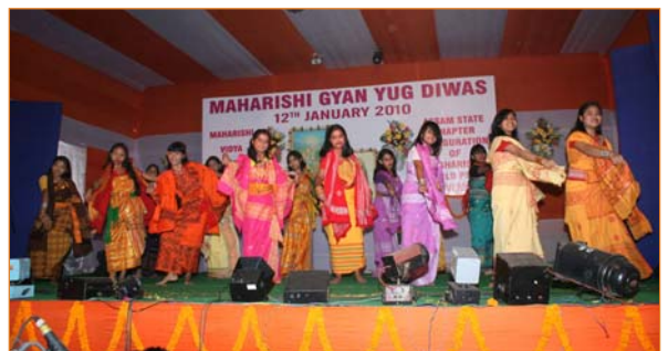
Students of MVMs Guwahati are performing folk dance