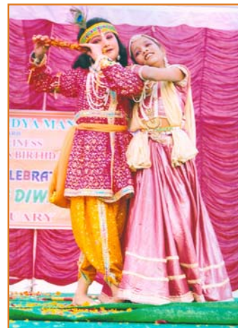
Students of MVM – I, Aligarh performing Krishna Leela on the occasion of Gyan Yug Diwas