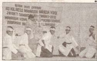
सांस्कृतिक कार्यक्रम प्रस्तुत करते विद्यालय के बच्चे।