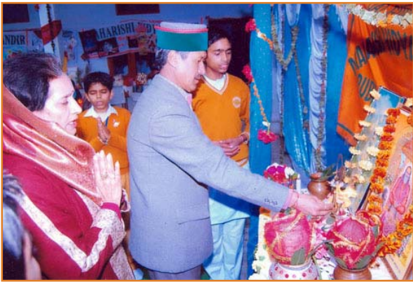
Sub - Divisional Magistrate, Kangra offering flowers to Guru Parampara on the occasion of Gyan Yug Diwas