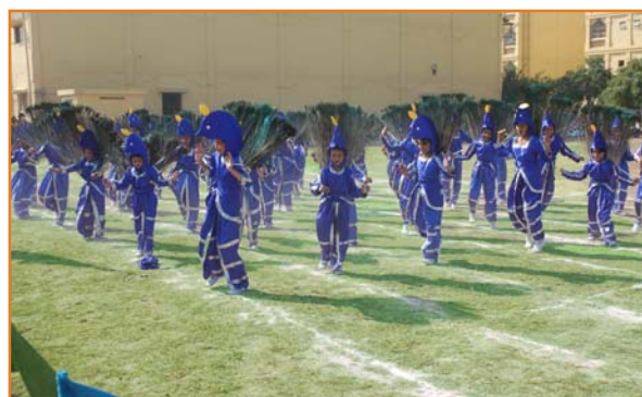
Students are performing group dance on the occasion of Annual Sports Day