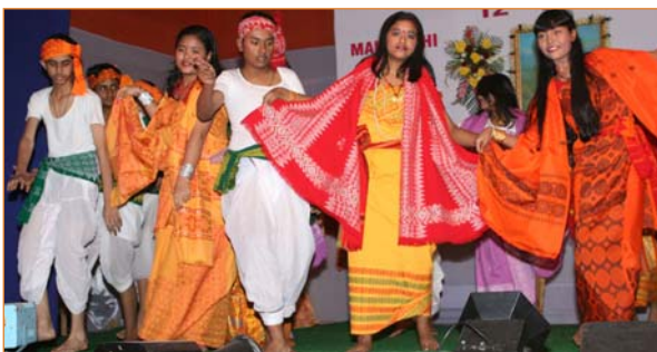
Students of MVMs Guwahati are performing folk dance