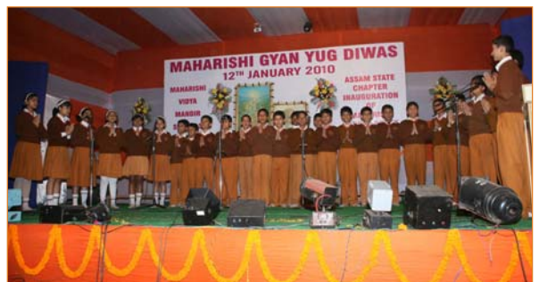
Students of MVMs Guwahati are presenting group song