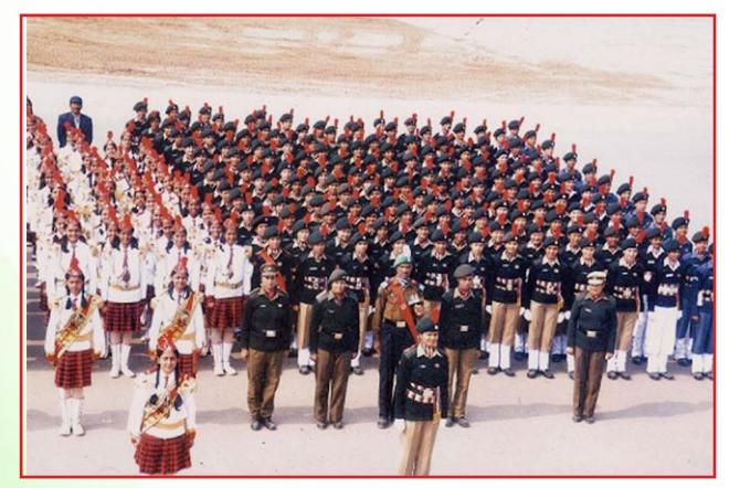
National Cadet Corps, Republic Day Camp 2012