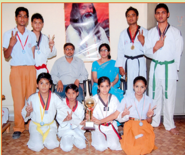
Taekwondo team bagged II Runners up (Boys U-19) in 4 th North Zone-II CBSE Taekwondo Championship.