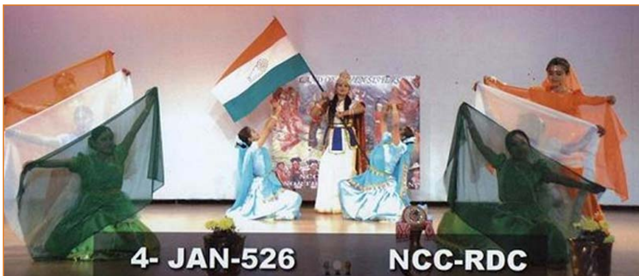
Cultural Panorama – Performing group dance during the Republic Day Camp at New Delhi