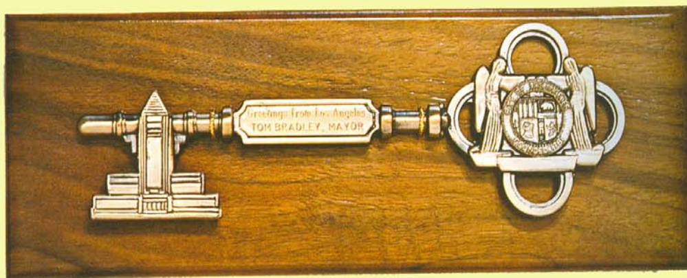
KEY OF THE CITY OF LOS ANGELES, CALIFORNIA, U.S.A.