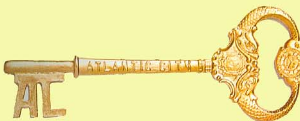
KEY OF THE CITY OF ATLANTIC CITY, NEW JERSEY, U.S.A.