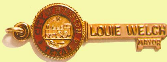
KEY OF THE CITY OF HOUSTON, TEXAS, U.S.A.