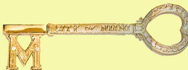
KEY OF THE CITY OF MIAMI, FLORIDA, U.S.A.