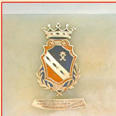
AWARD PRESENTED BY THE MAYOR OF FIUGGI, ITALY SPRING 1972