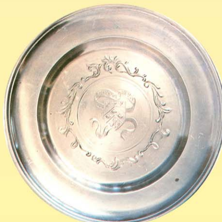
AWARD PRESENTED BY THE MAYOR OF THE CITY OF KNOKKE, BELGIUM, WINTER 1975