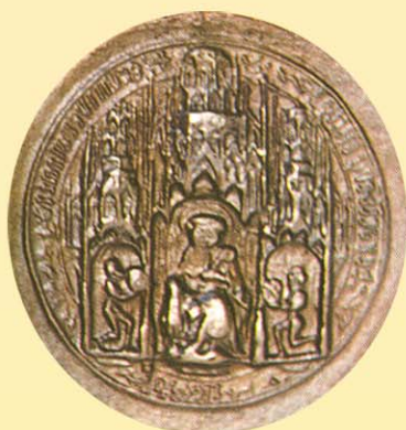
AWARD PRESENTED BY THE RECTOR OF THE UNIVERSITY OF HEIDELBERG, HEIDELBERG, GERMANY, SPRING 1974