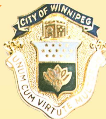
AWARD PRESENTED BY THE MAYOR OF THE CITY OF WINNIPEG MANITOBA, CANADA, SPRING 1975