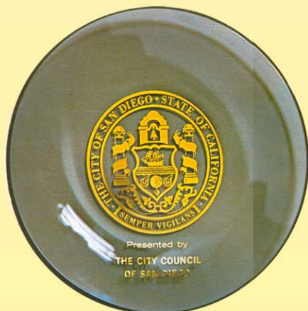
AWARD PRESENTED BY THE CITY COUNCIL OF SAN DIEGO, CALIFORNIA, U.S.A.