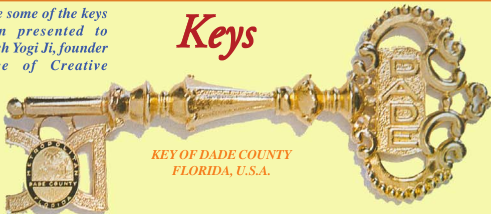
KEY OF DADE COUNTY FLORIDA, U.S.A.