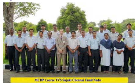
MCDP Course TVS Sujuki Chennai Tamil Nadu