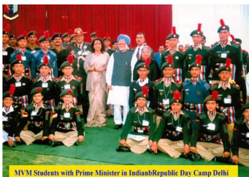
MVM Students with Prime Minister in Indian Republic Day Camp Delhi

Most of our branches achieved 100% results in CBSE 10th and 12th class exams. Hundreds of Maharishi Students have obtained 95-100% marks in difference subjects and have achieved merit positions in districts, states and national merit list.