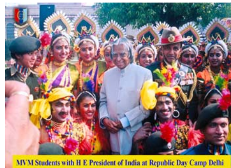
MVM Students with H E President of India at Republic Day Camp Delhi

This was also a good year for Maharishi Centre for Education Excellence. The Students have participated in many national level conferences and competitions and have won large number of awards.