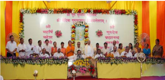
मंच पर विराजमान सभी विशिष्ट अतिथियों के साथ विश्वशांति आन्दोलन के सभी प्रदेश अध्यक्ष एवं सचिव

श्री गुरुदेव ब्रह्मानन्द सरस्वती जी के आशीर्वाद से और उनकी प्रेरणा स्वरूप पूज्य महर्षि महेश योगी जी ने 50 वर्ष पूर्व विश्व व्यापी आध्यात्मिक पुनरुत्थान आंदोलन की स्थापना की और सम्पूर्ण विश्व के कोने-कोने में स्वयं निरन्तर भ्रमण करके आध्यात्मिक और आधिदैविक क्रान्ति का शंखनाद किया।