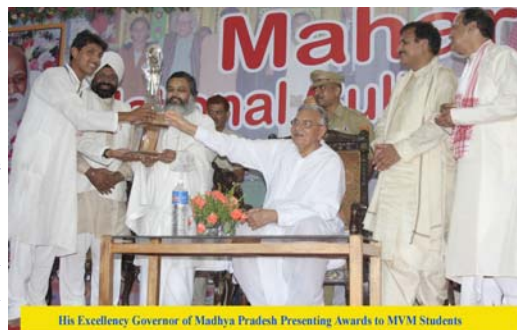
His Excellency Governor of Madhya Pradesh Presenting Awards to MVM Students

Several hundred students have succeeded in national level prestigious admission entrance test exams, like Common Admission Test-CAT, Indian Institute of Technology, Central Pre-Medical Test, State Pre-Medical Test, National Defence