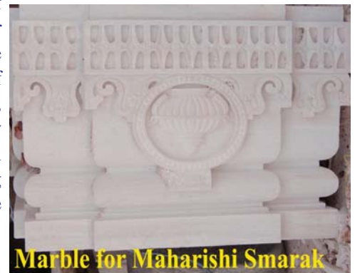
Marble for Maharishi Smarak

I bow down again to the lotus feet of Shri Guru Dev and Maharishi Ji with chant of their wish for the word.