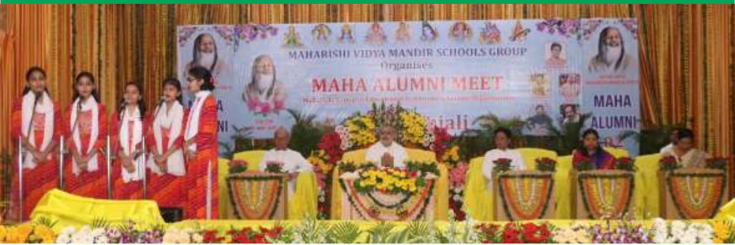
PHOTO GALLERY OF MAHA ALUMNI CELEBRATION-2023