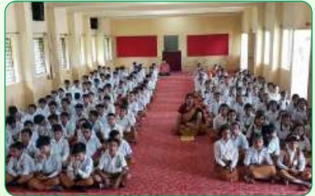
MVM Aligarh Main