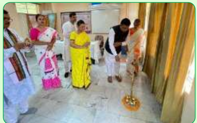
MVM Guwahati Shilpkhuri