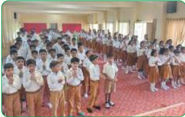
MVM Aligarh Main

As per tradition, the celebration started with performing of Shri Guru Parampara Poojan and thereafter all the staff members practiced Transcendental Meditation and Siddhi Programme. After this, year-long achievements of all the schools and other organisations were dedicated to lotus feet of Shri Gurudev and His Holiness Maharishi Mahesh Yogi Ji. These celebration are presented through picture gallery below –