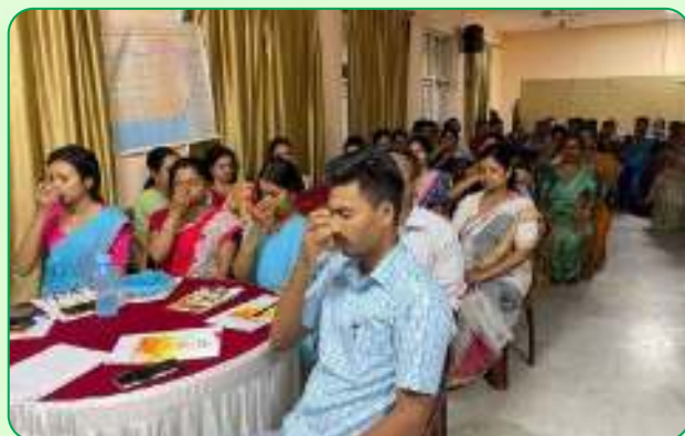
MVM Shilpkhuri Guwahati