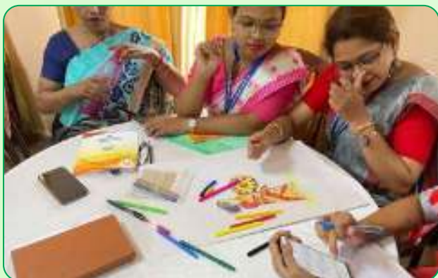
MVM Shilpkhuri Guwahati

During this training, above two subjects have been supported by Principles of Maharishi Consciousness Based Education (MCBE). This training have been carried out with the active participation of experienced and professionally competent Principals and senior teachers and also some of outside faculty. Teachers have enjoyed the training and have been benefited a lot from this.