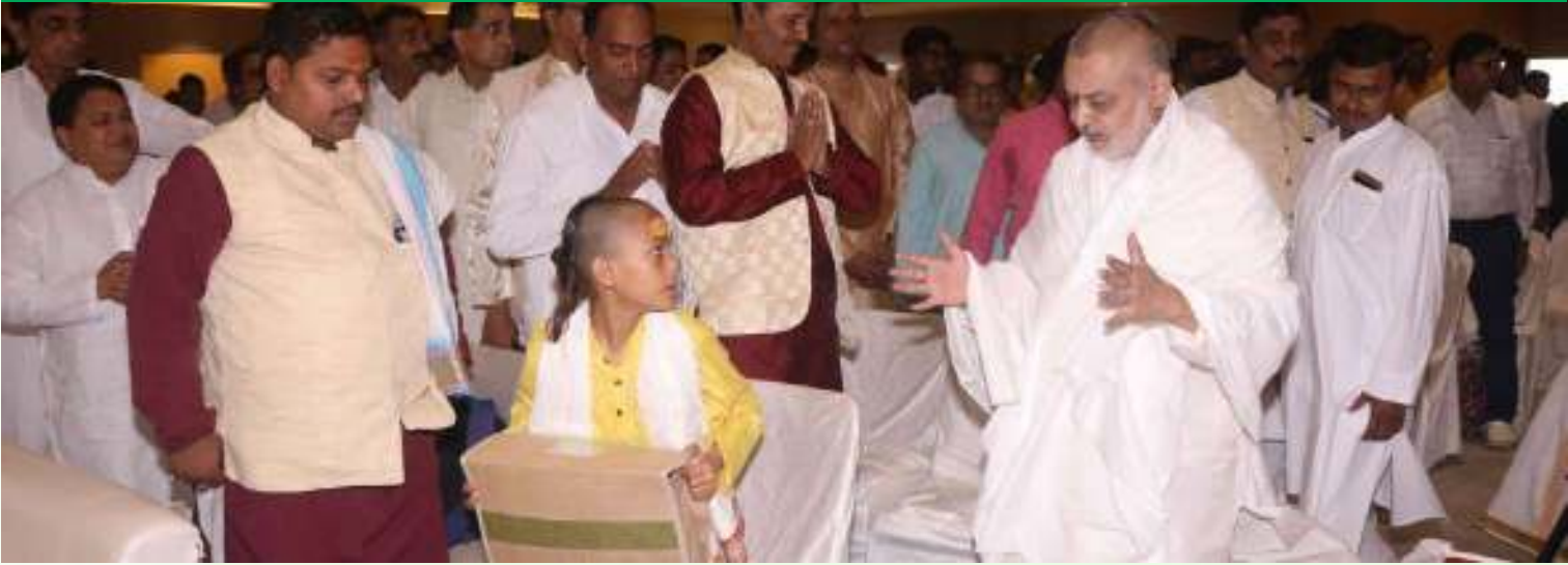
PHOTO GALLERY OF GURU PURNIMA CELEBRATION-2023