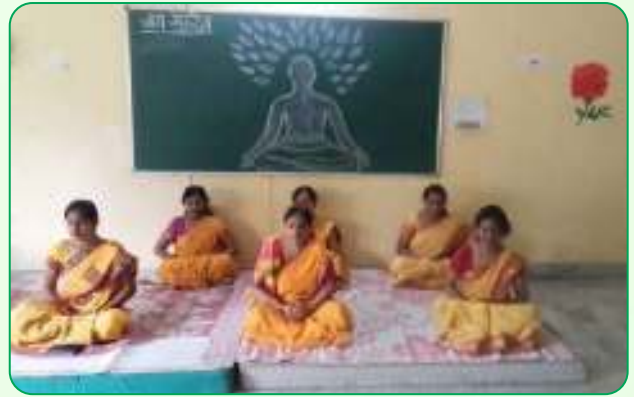
MVM Naini Prayagraj