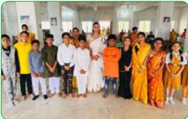
MVM Jabalpur Vijay Nagar