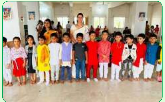
MVM Jabalpur Vijay Nagar