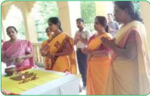
MVM Naini Prayagraj