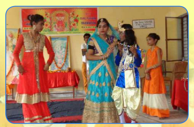
Maharishi Vidya Mandir Gonda