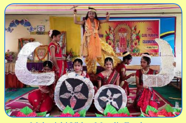
Maharishi Vidya Mandir Fatehpur