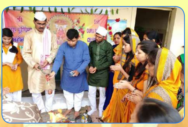
Maharishi Vidya Mandir Khatima