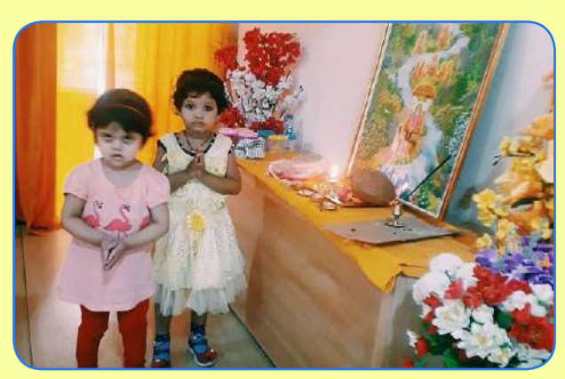
Maharishi Kids Home, Arera Colony, Bhopal