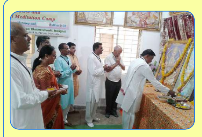
Maharishi Vidya Mandir Balaghat