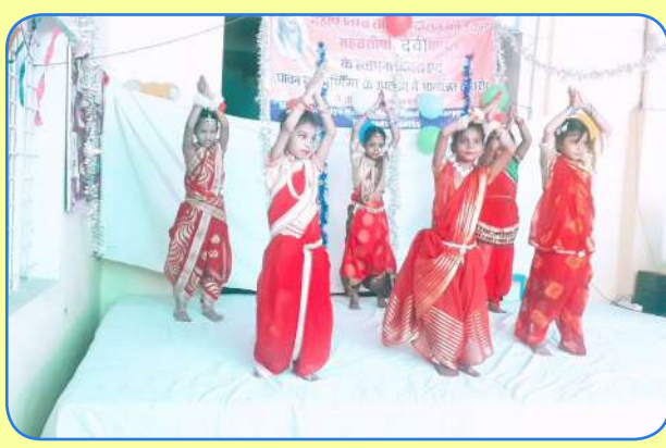
Maharishi Vidya Mandir Chhatarpur