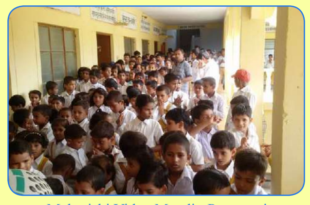
Maharishi Vidya Mandir, Prayagraj