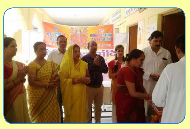
Maharishi Vidya Mandir, Prayagraj