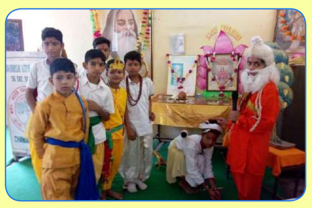
Maharishi Vidya Mandir Gurugram