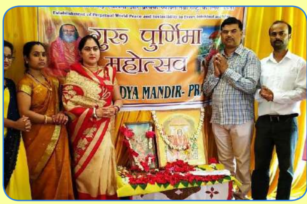
Maharishi Vidya Mandir, Pratappur