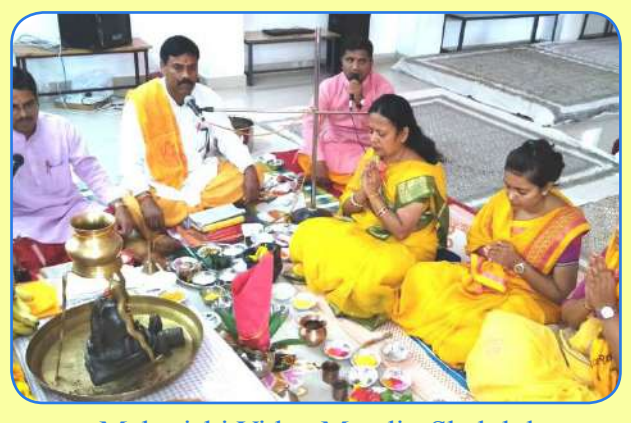
Maharishi Vidya Mandir, Shahdol