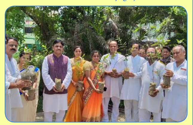
Plantation at MUMT, Bilaspur (CG)