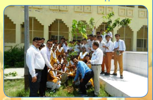
Plantation at MVM Aligarh