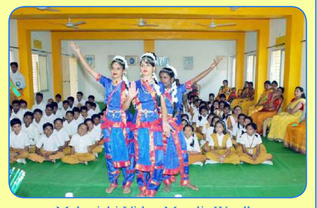
Maharishi Vidya Mandir Wardha