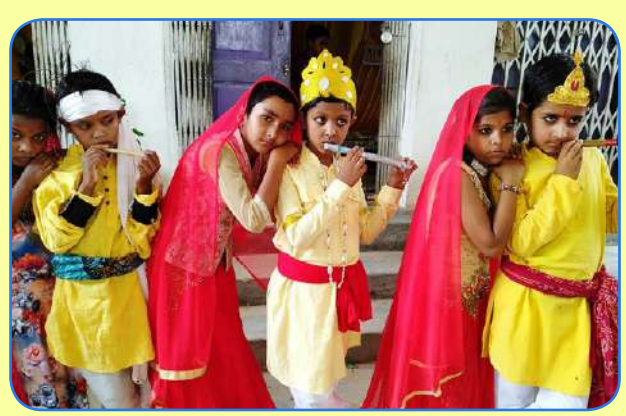
Maharishi Vidya Mandir, Pratappur