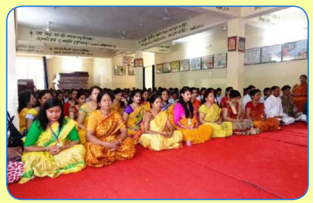
Maharishi Vidya Mandir Haldwani