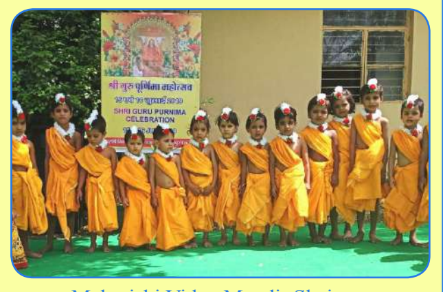
Maharishi Vidya Mandir Shajapur