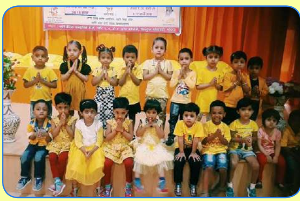
Maharishi Kids Home, Arera Colony, Bhopal