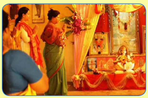
Maharishi Vidya Mandir-I, Raipur