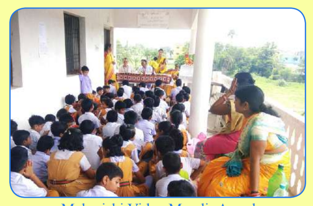
Maharishi Vidya Mandir Angul