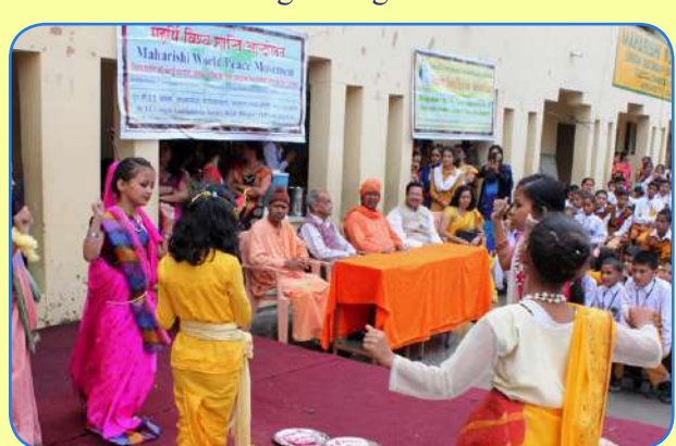
Maharishi Vidya Mandir Almora