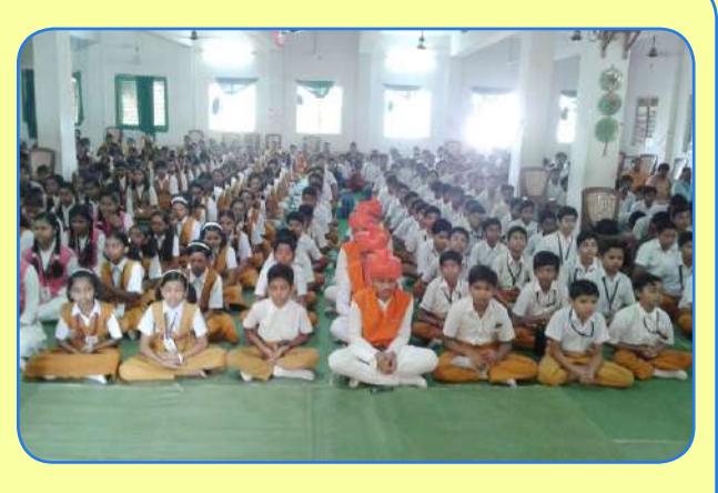
Maharishi Vidya Mandir Balaghat