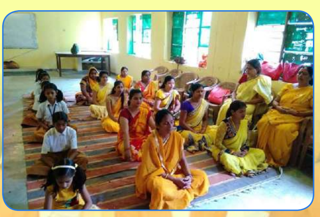
Maharishi Vidya Mandir Barabanki