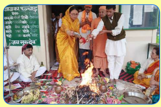
Maharishi Vidya Mandir, Pithoragarh