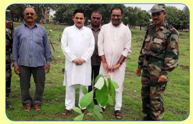
Plantation at Prayagraj