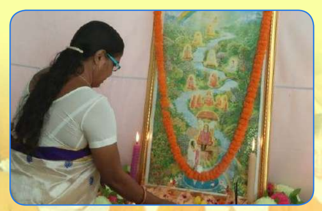
Maharishi Vidya Mandir Silchar