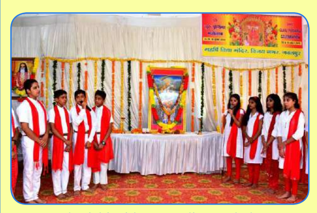
Maharishi Vidya Mandir-V Jabalpur