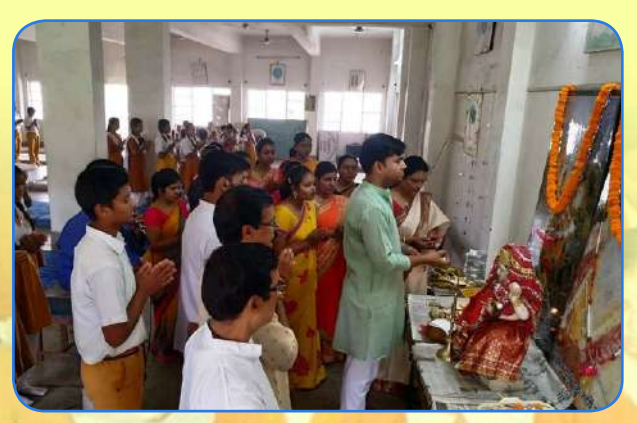
Maharishi Vidya Mandir, Raigarh