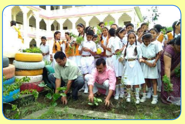
Maharishi Vidya Mandir Kotdwar