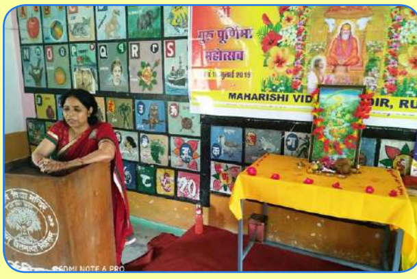
Maharishi Vidya Mandir Rudrapur