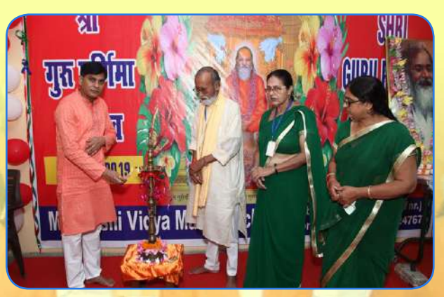
Maharishi Vidya Mandir Yamuna Nagar