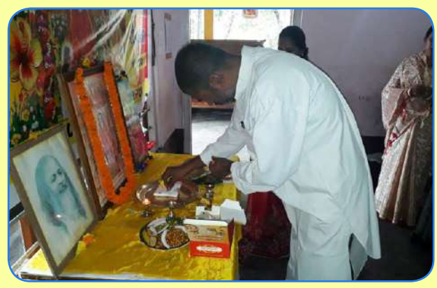
Maharishi Vidya Mandir Tezpur