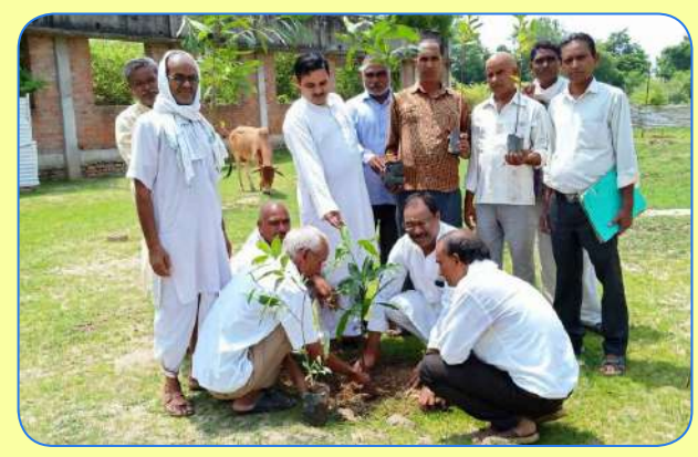
Plantation at Prayagraj