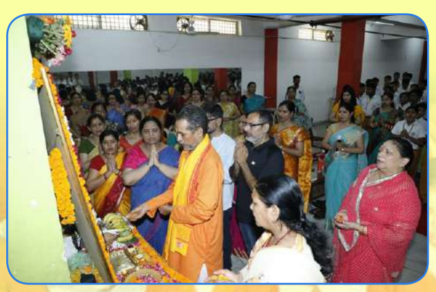
Maharishi Vidya Mandir, Noida