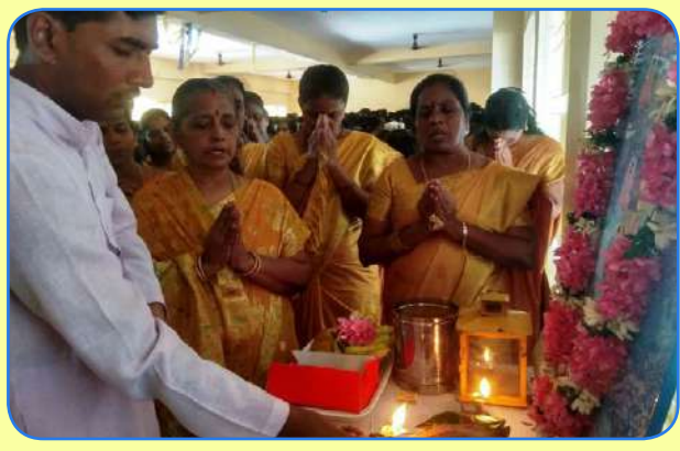
Maharishi Vidya Mandir Tiruvannamalai