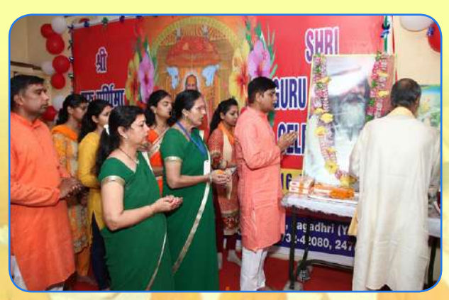
Maharishi Vidya Mandir Yamuna Nagar