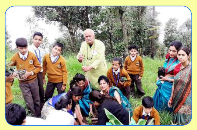
Plantation at MVM Nainital