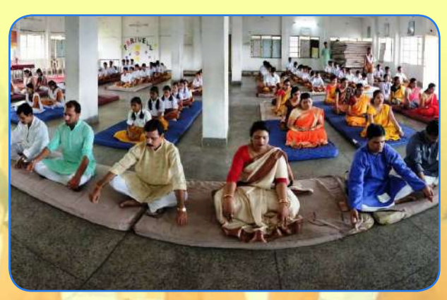
Maharishi Vidya Mandir, Raigarh