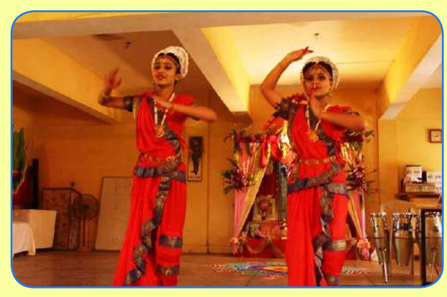
Maharishi Vidya Mandir-I, Raipur