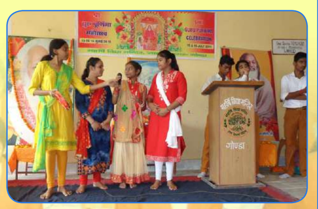
Maharishi Vidya Mandir Gonda