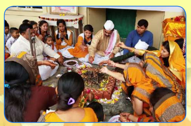
Maharishi Vidya Mandir Khatima