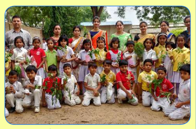
Plantation at MVM Pratappur