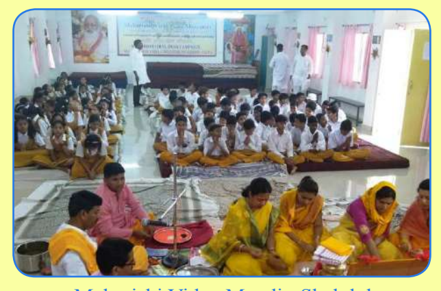
Maharishi Vidya Mandir, Shahdol