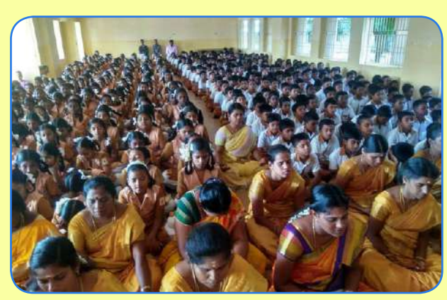
Maharishi Vidya Mandir Tiruvannamalai