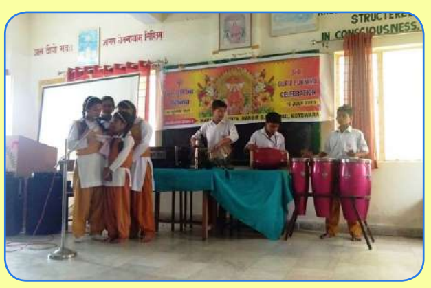
Maharishi Vidya Mandir Kotdwar