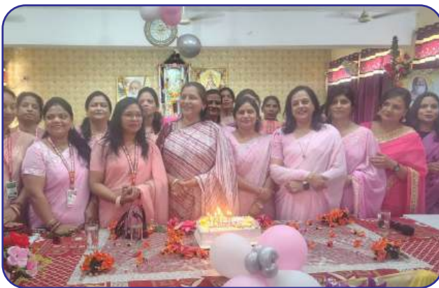
Maharishi Vidya Mandir, Seoni