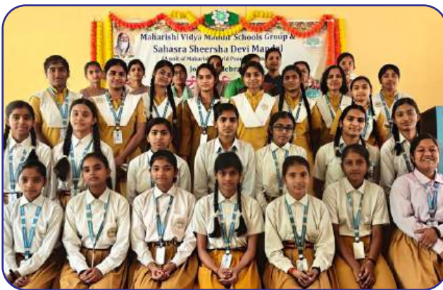
Maharishi Vidya Mandir, Junsi Prayagraj