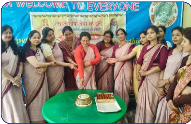
Maharishi Vidya Mandir, Khatima