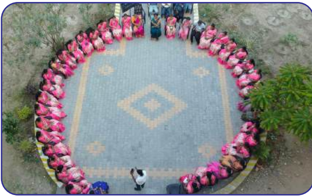
Maharishi Vidya Mandir, Tiruvannamalai

International Women's Day celebration is presented below through picture gallery: