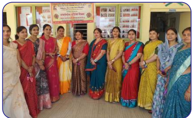
Maharishi Vidya Mandir, Amarpatan