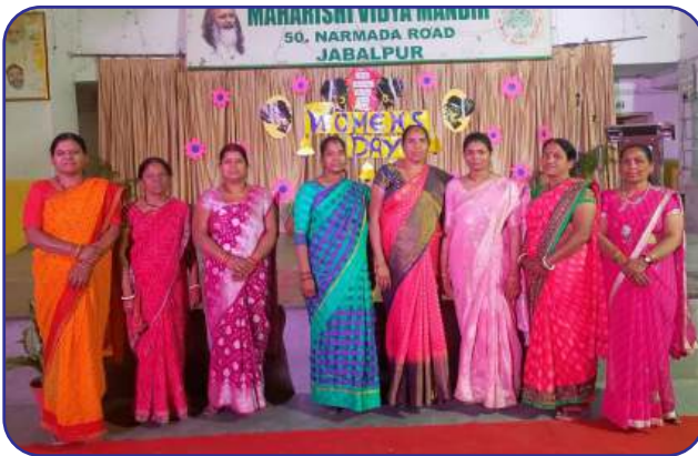
Maharishi Vidya Mandir-I, Jabalpur