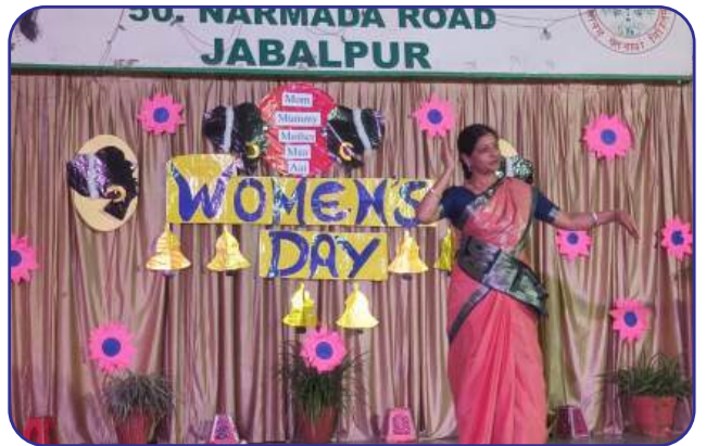
Maharishi Vidya Mandir-I, Jabalpur