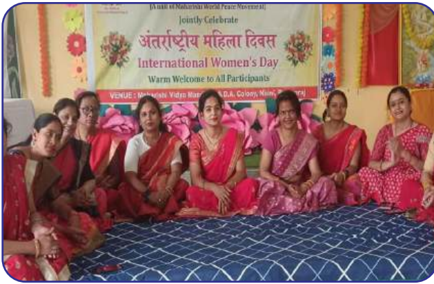
Maharishi Vidya Mandir, Naini, Prayagraj