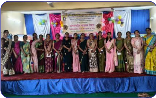
Maharishi Vidya Mandir, Khargone