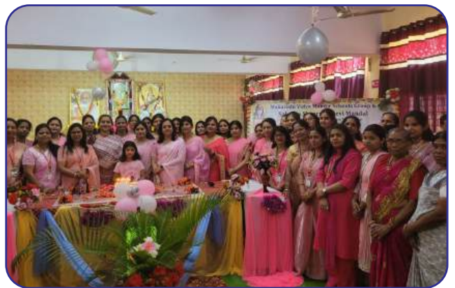
Maharishi Vidya Mandir, Seoni