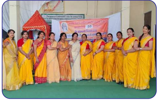
Maharishi Vidya Mandir-3, Chhatarpur