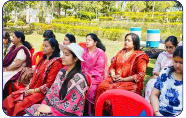
Maharishi Vidya Mandir, Shahdol