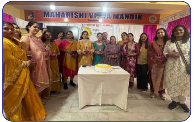
Maharishi Vidya Mandir, Jammu