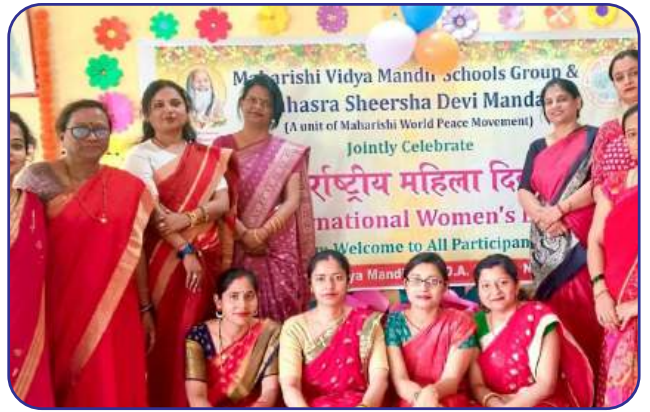
Maharishi Vidya Mandir, Naini, Prayagraj