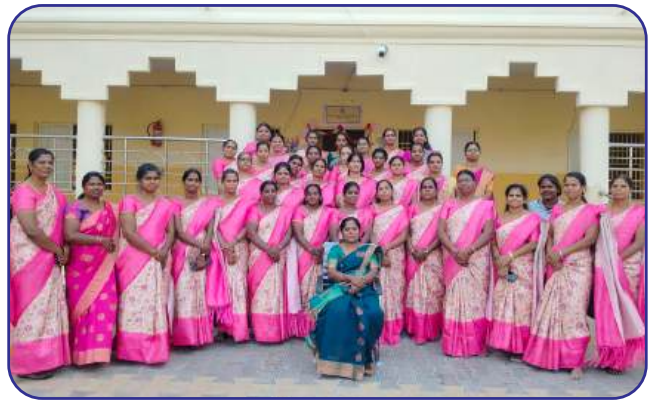
Maharishi Vidya Mandir, Tiruvannamalai