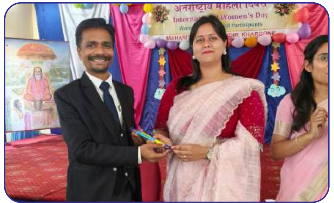
Maharishi Vidya Mandir, Khargone