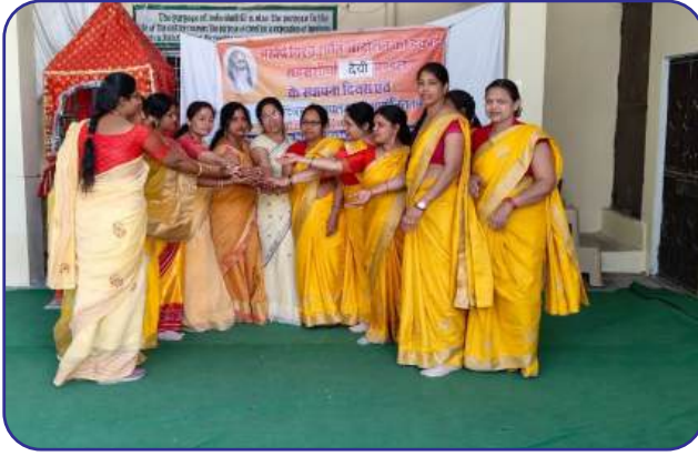
Maharishi Vidya Mandir-3, Chhatarpur