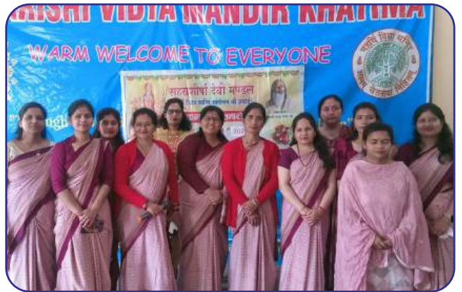
Maharishi Vidya Mandir, Khatima