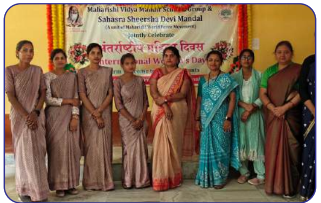
Maharishi Vidya Mandir, Junsi Prayagraj