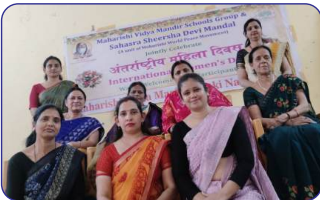
Maharishi Vidya Mandir, Gonda