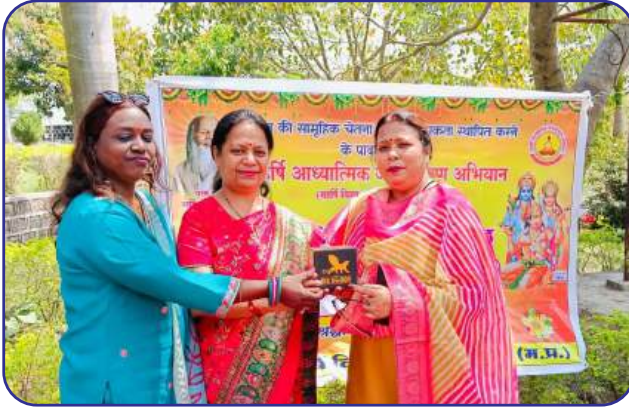
Maharishi Vidya Mandir, Shahdol