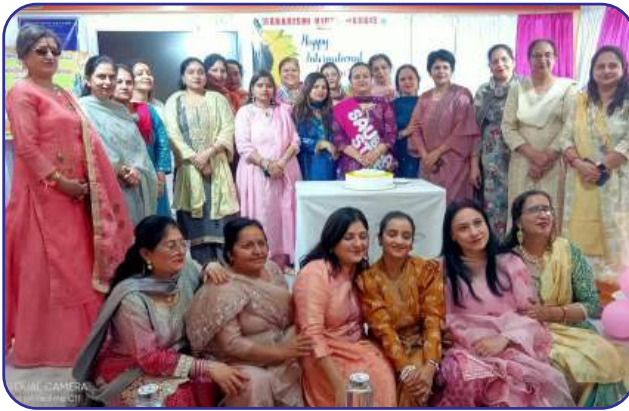
Maharishi Vidya Mandir, Jammu