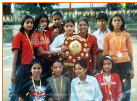
Runner State Level Volley Ball - 2008 Sub-Junior Under 14

* Declared best school in sports activities 2008-2009 at state level.