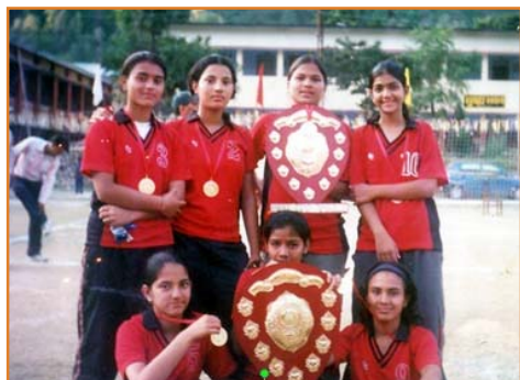
Winner State Level Volley Ball - 2008 Junior Under 17