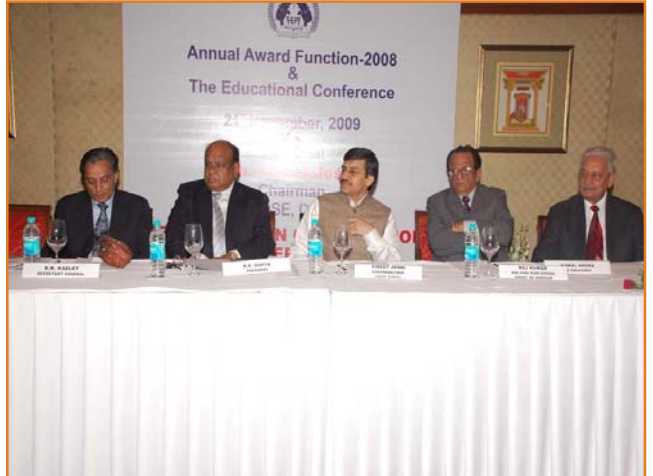
Members the Federation of Educational Publishers in India, present in Award Ceremony.