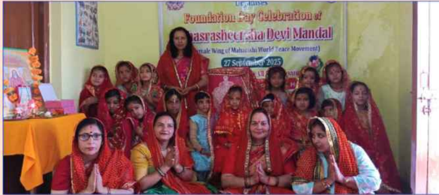
Maharishi Vidya Mandir - II, Almora